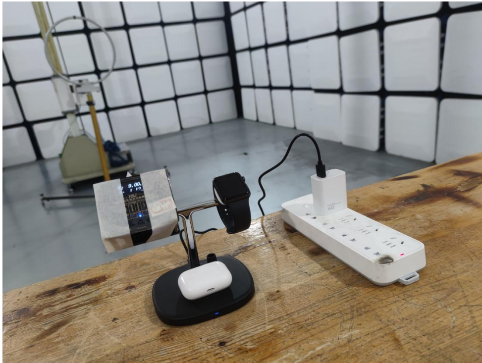
Photo of MPE Measurement