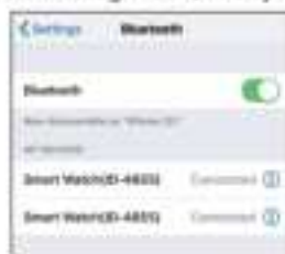
System under iOS13

Apple devices connect to Bluetooth for calling: (iOS13 and above systems automatically connect to Bluetooth for calling after connecting to APP; and systems below IOS 13 need to manually connect to Bluetooth for calling.)