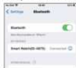
iOS13-system and above

After the APP connects the watch, turn on the Bluetooth switch of the watch, then turn on the settings of the mobile phone, Bluetooth, search for Smart Watch(ooo), and click Connect.