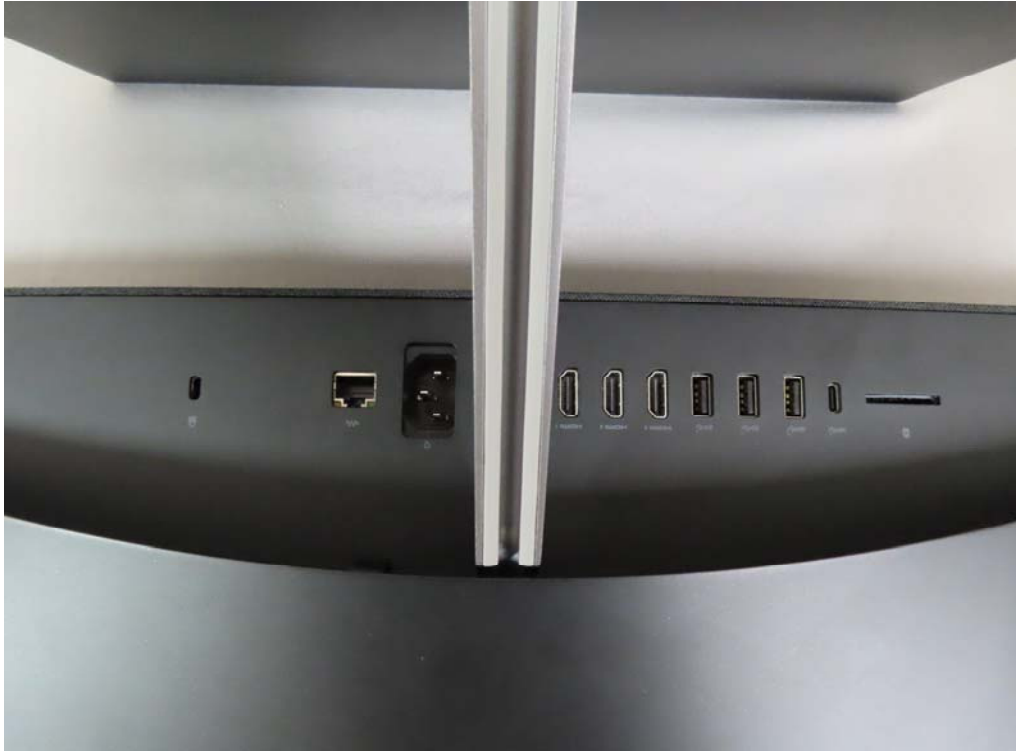
Side View of EUT – 6