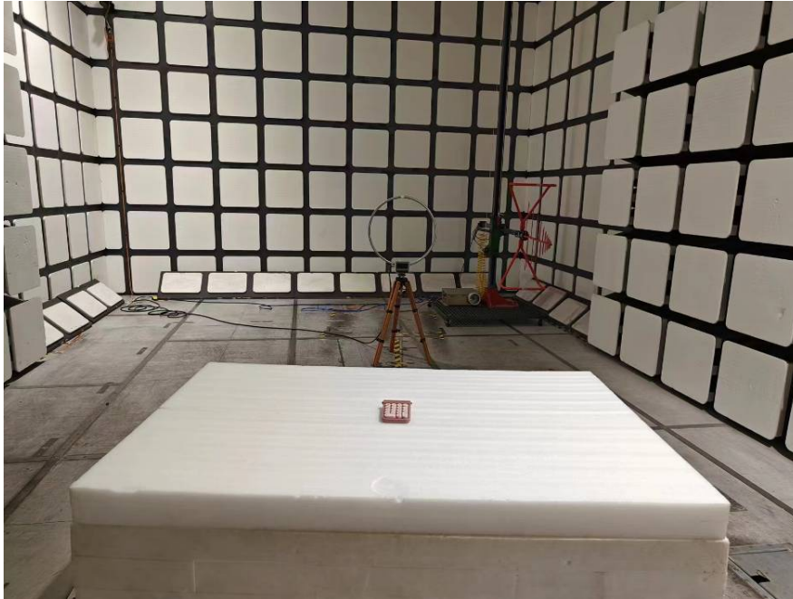
Radiated Emissions View (30 MHz- 1 GHz)