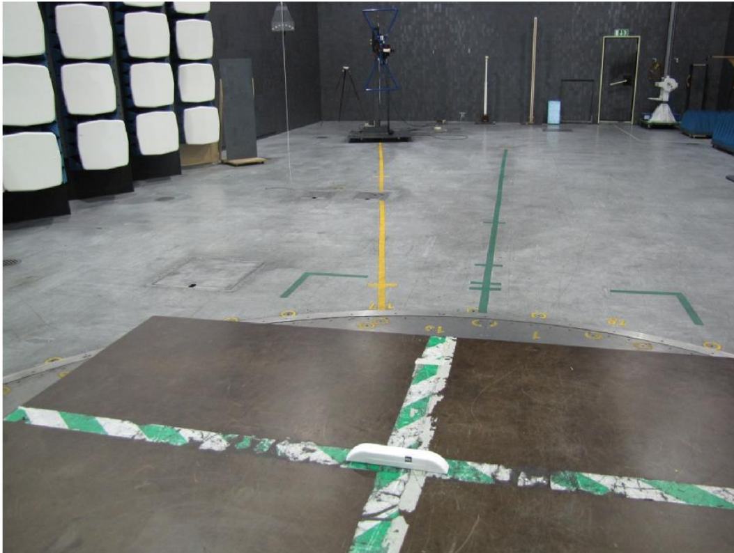
Test set up radiated emission 30 MHz – 1GHz