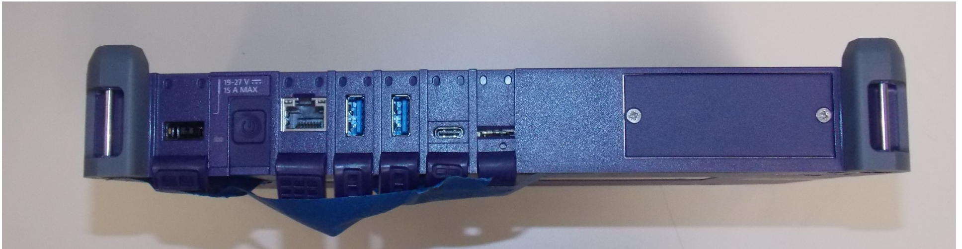
Top Side with Port Covers Open