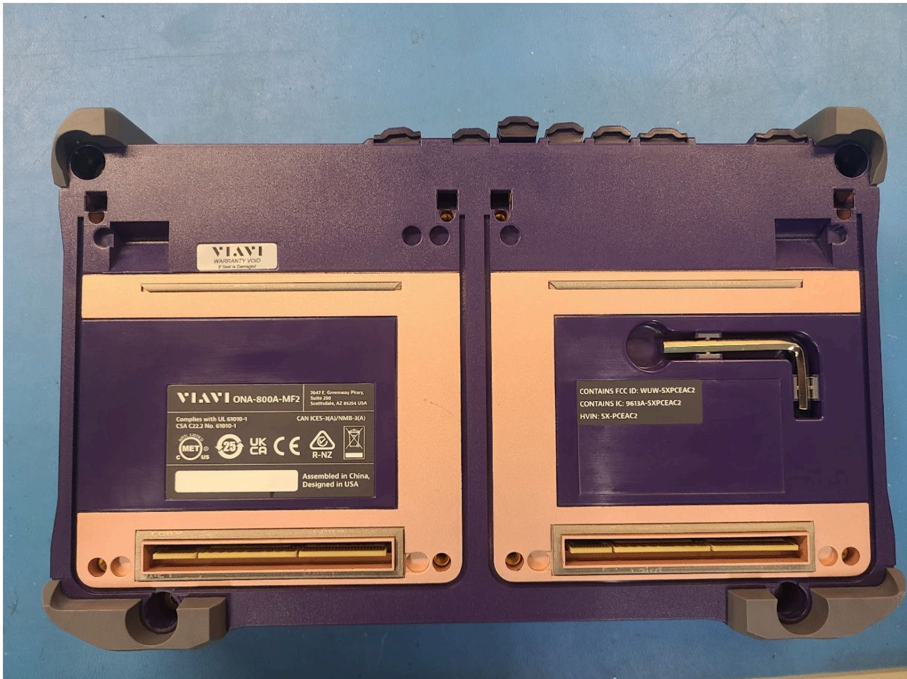
Back of Device