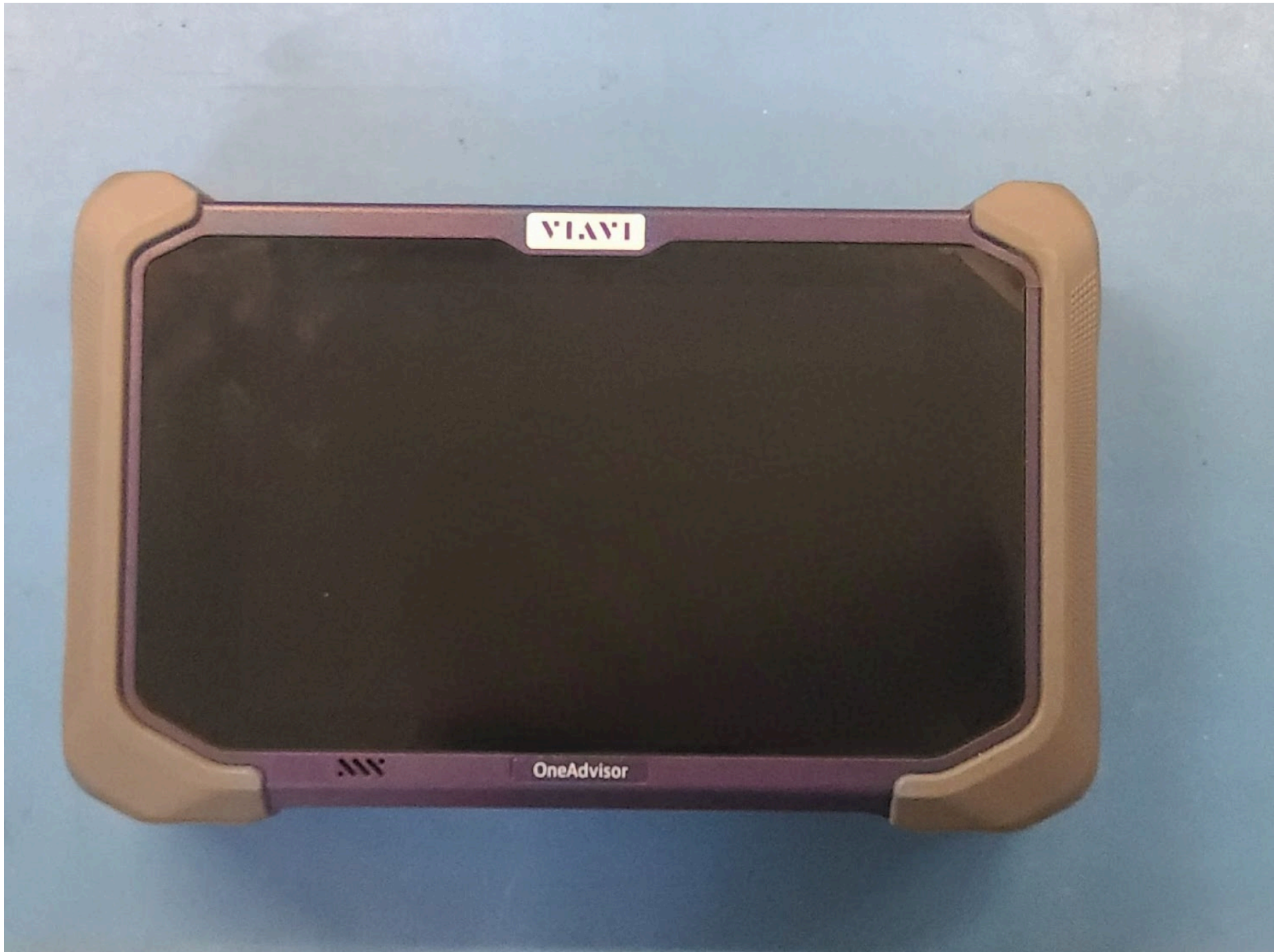
Front of Device