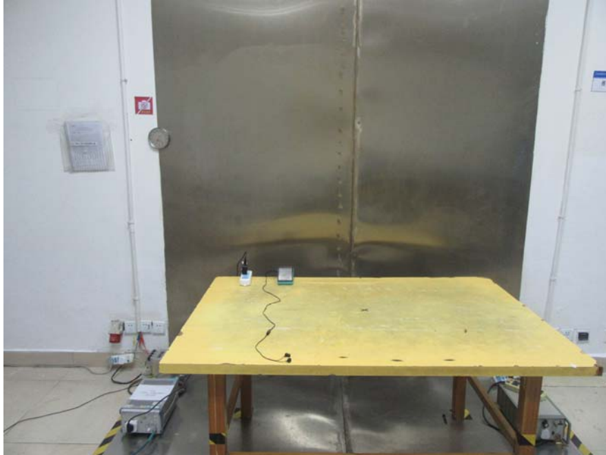
Conducted Emissions – Side View