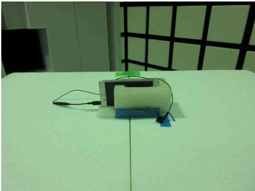
– Y-axis –