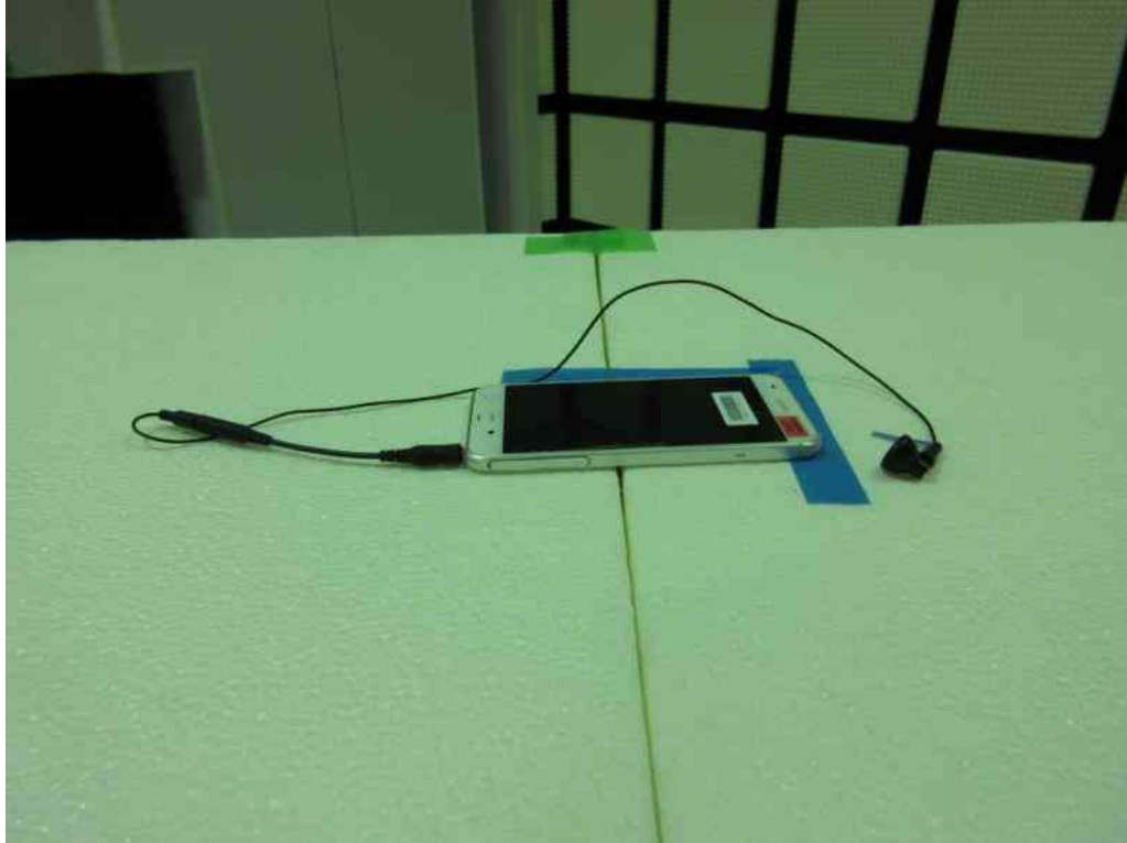
– X-axis –