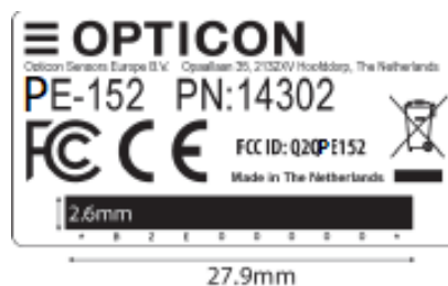
Figure 3: Product Label dimensions

This serial number is the same as the MAC address in the ESL-label, with the first 6 digits ('3889DC') replaced by a 'B'.