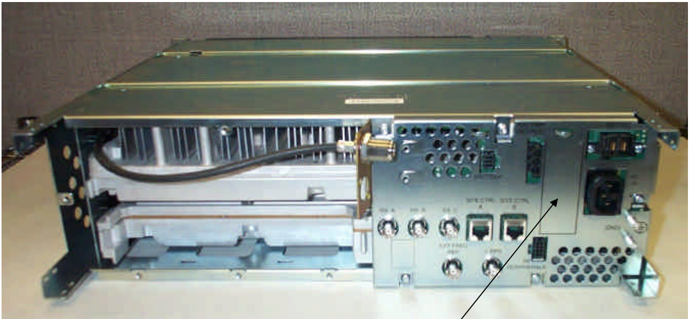
Location of FCC ID Label

The location of the FCC ID label is on the back of the radio, as shown in the photograph below.