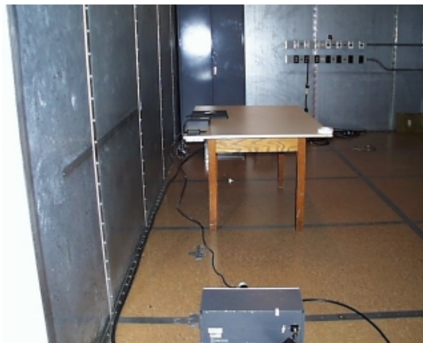
Photo 3 – Photo of Conducted Emission test setup of Counterpoint IX 4/6 Mode and 5 Mode