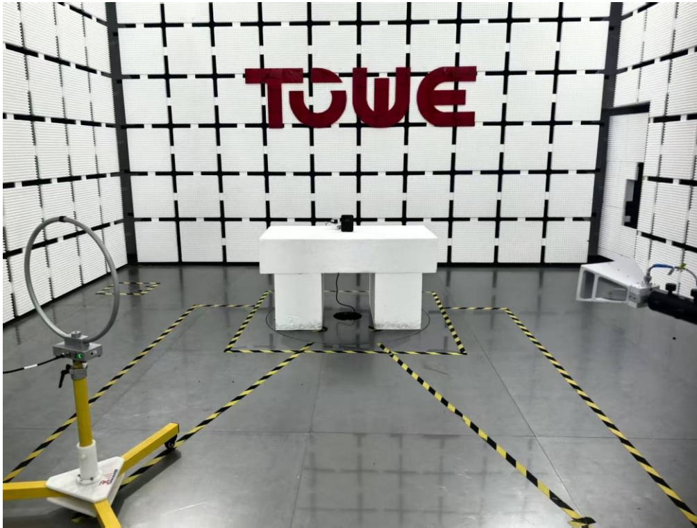
Radiated Spurious Emissions (9kHz to 30MHz)