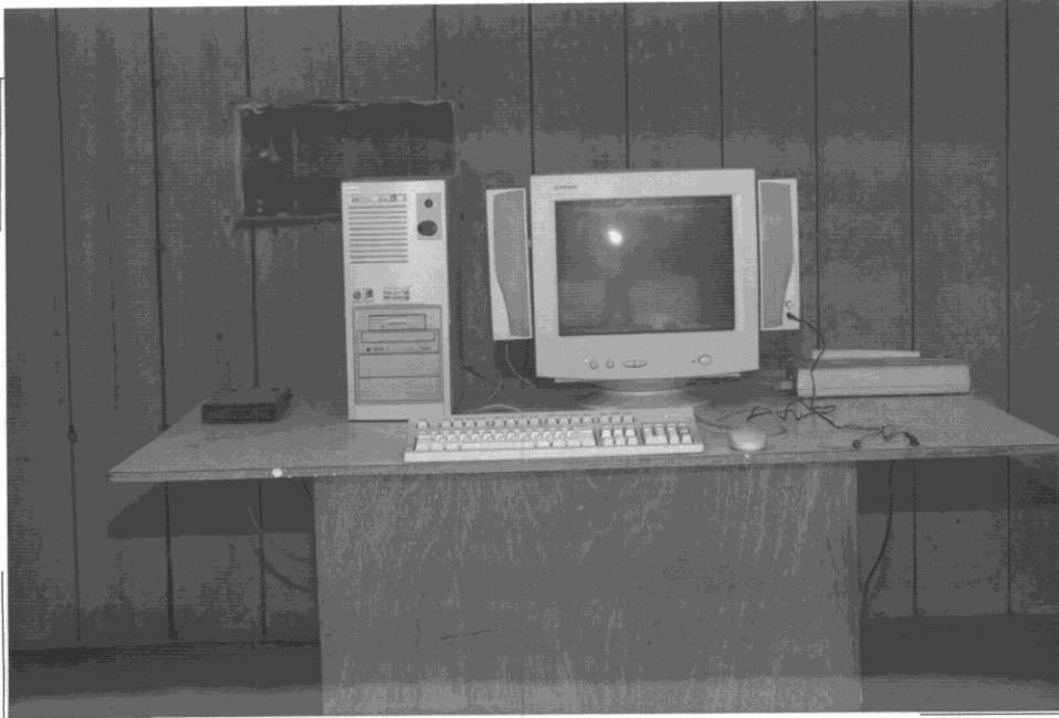
Front View of Radiated Measurement