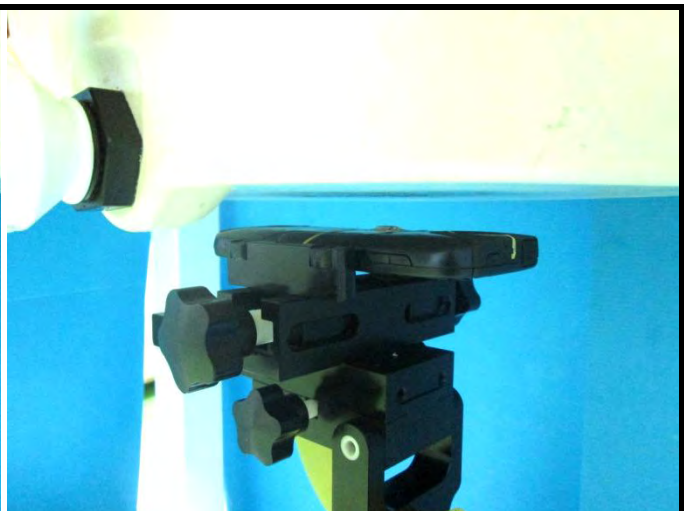
Rear Face of EUT with 1.5 cm Gap