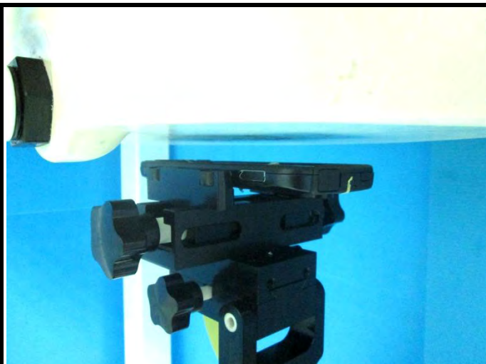
Front Face of EUT with 1.5 cm Gap