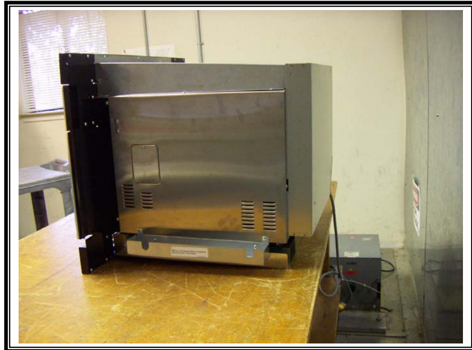
AC Line Conduction back