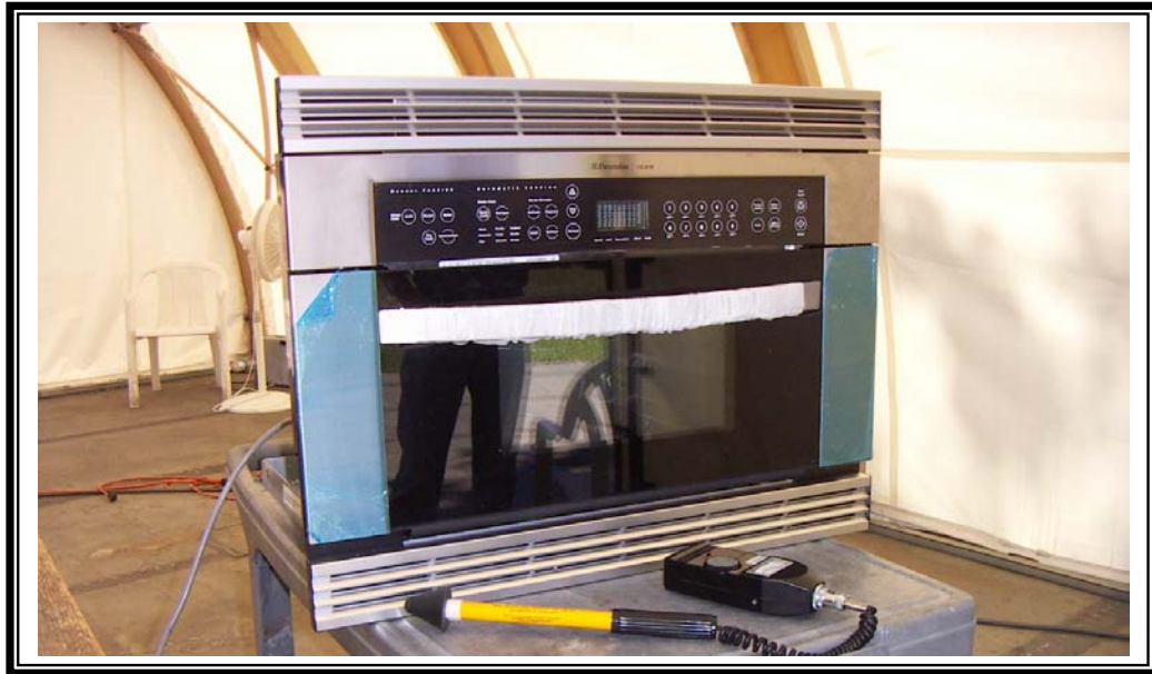
Radiation Hazard Measurement