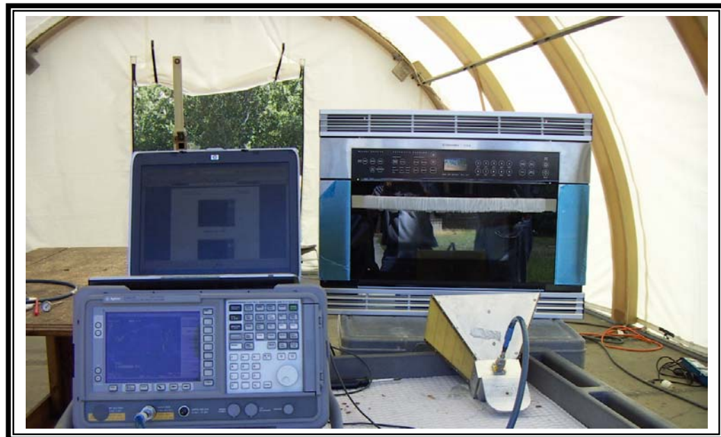
Operating Frequency Measurements