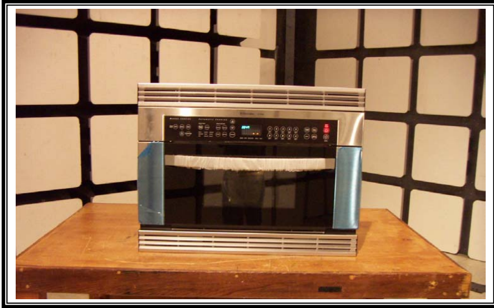
Radiation Measurement front