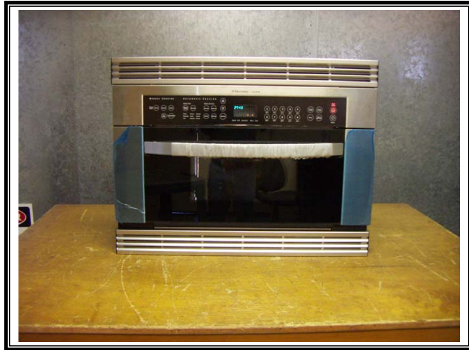
AC Line Conduction Front