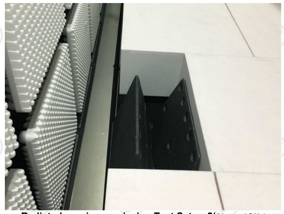
Radiated spurious emission Test Setup-5(Above 1GHz) There are absorbing materials under the ground.