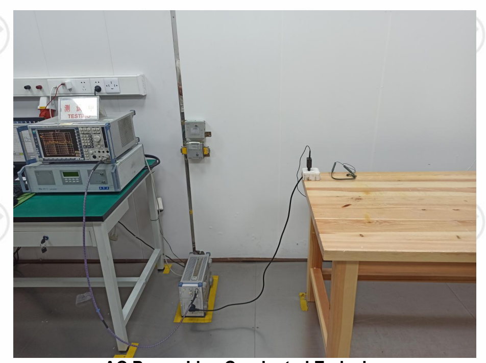
AC Power Line Conducted Emission