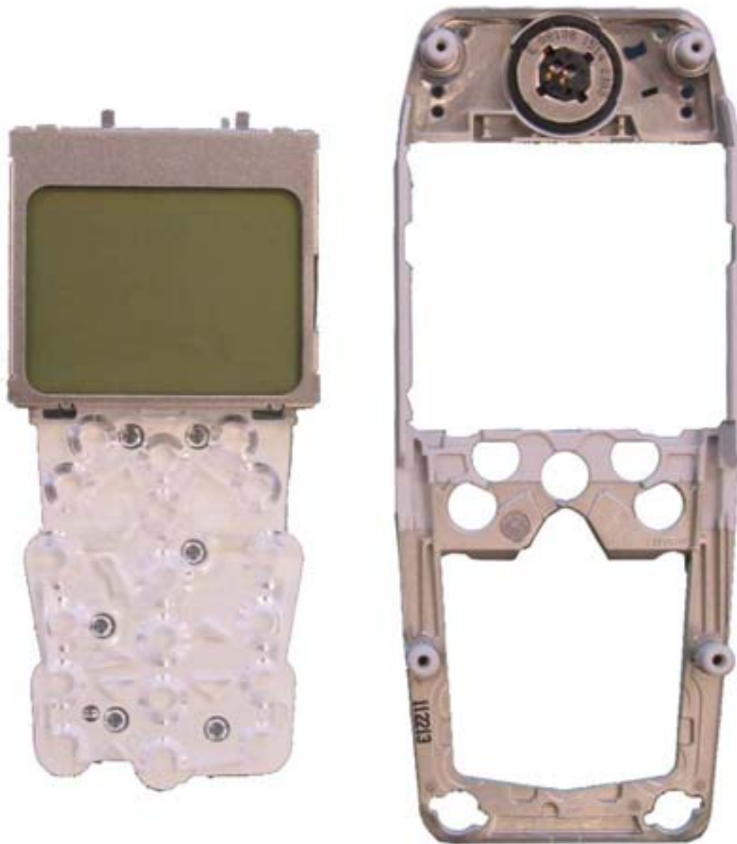
Exhibit 9: Internal Photographs