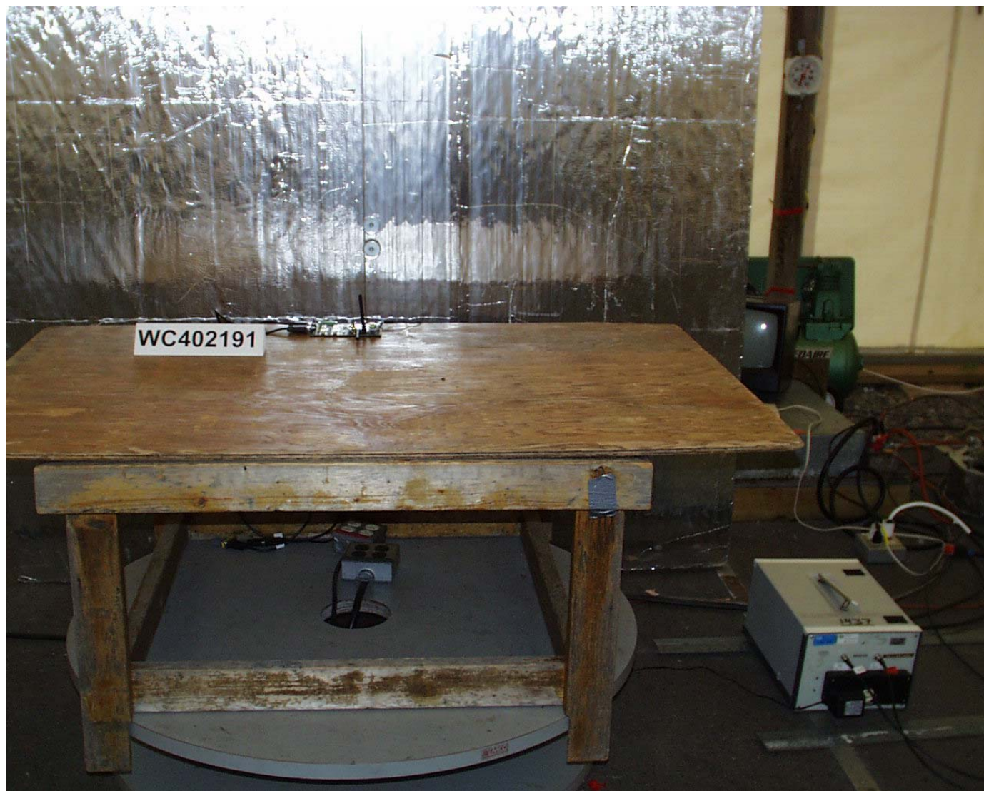
Test-setup photo(s): Conducted emission 150 kHz - 30 MHz