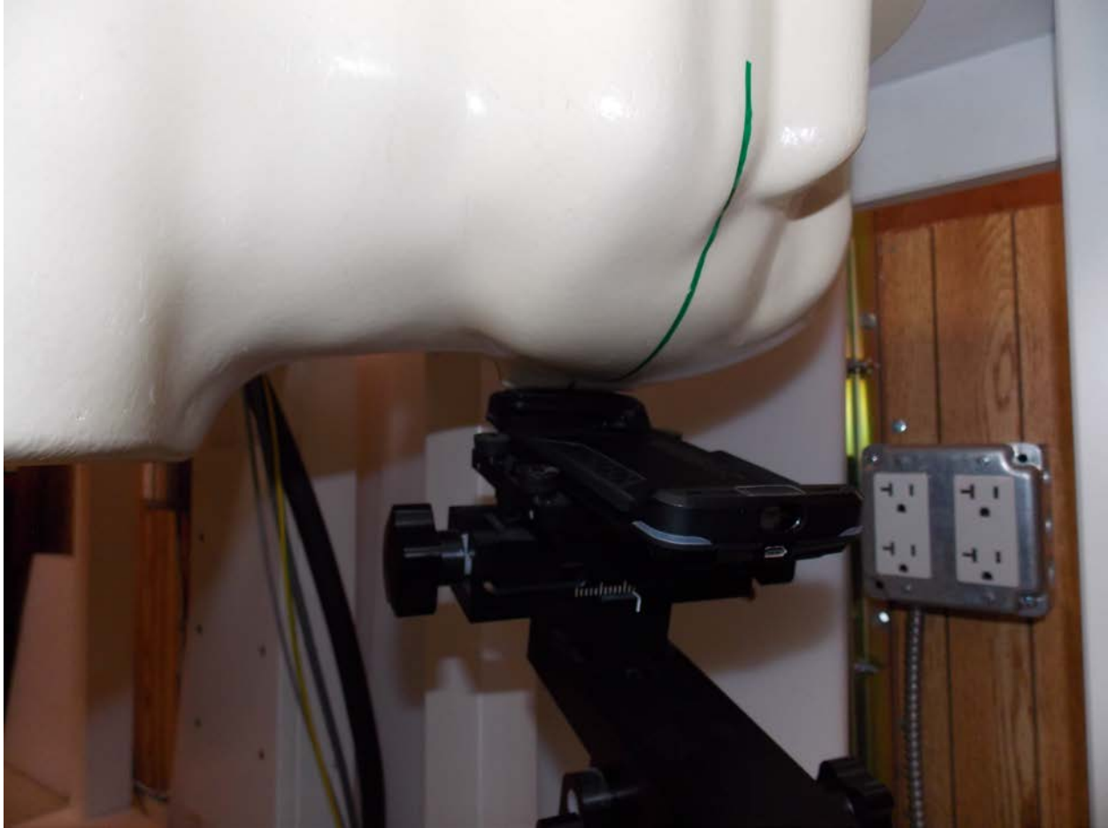
Left Touch Case Only