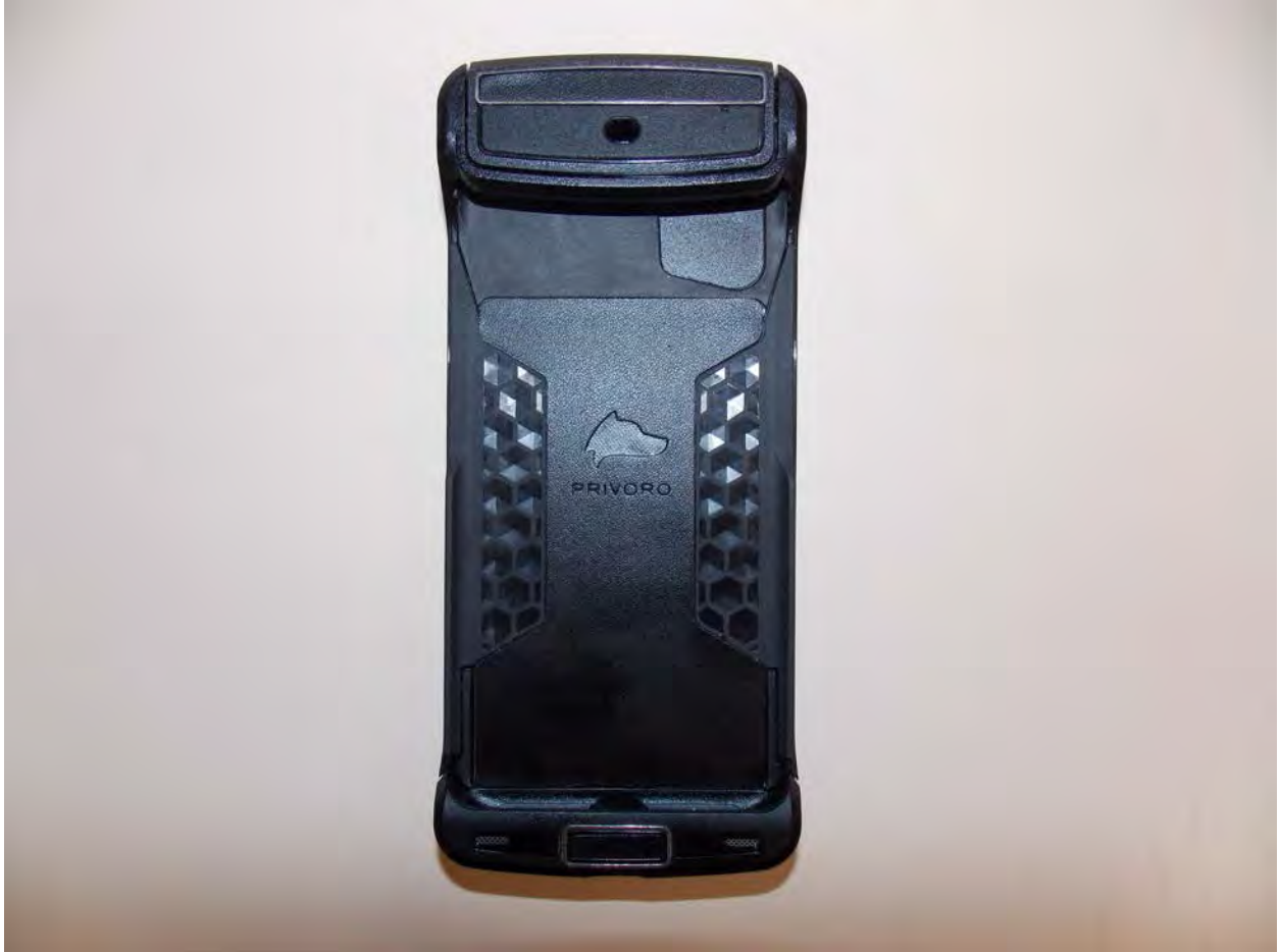
Front of Device (Case)