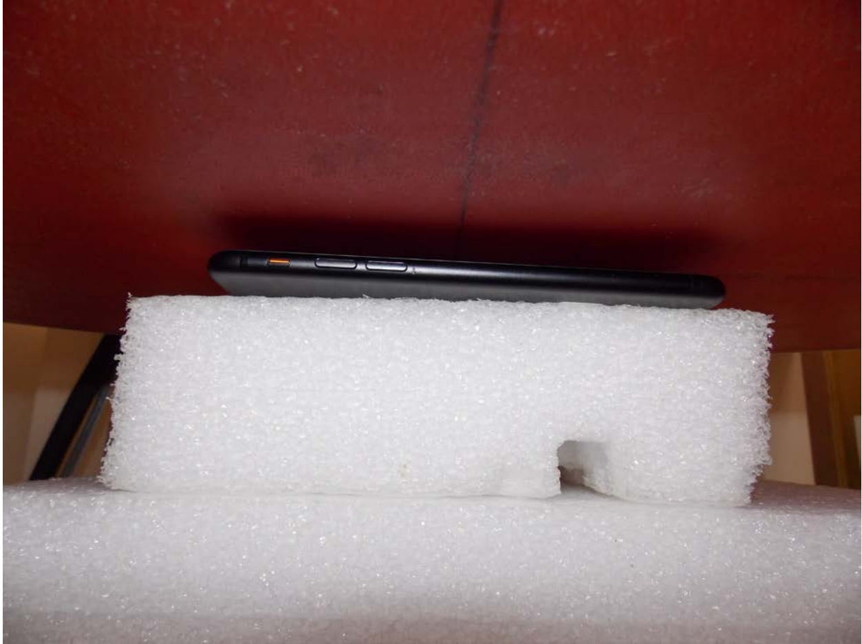
Body Front Configuration No Case 5 mm Gap