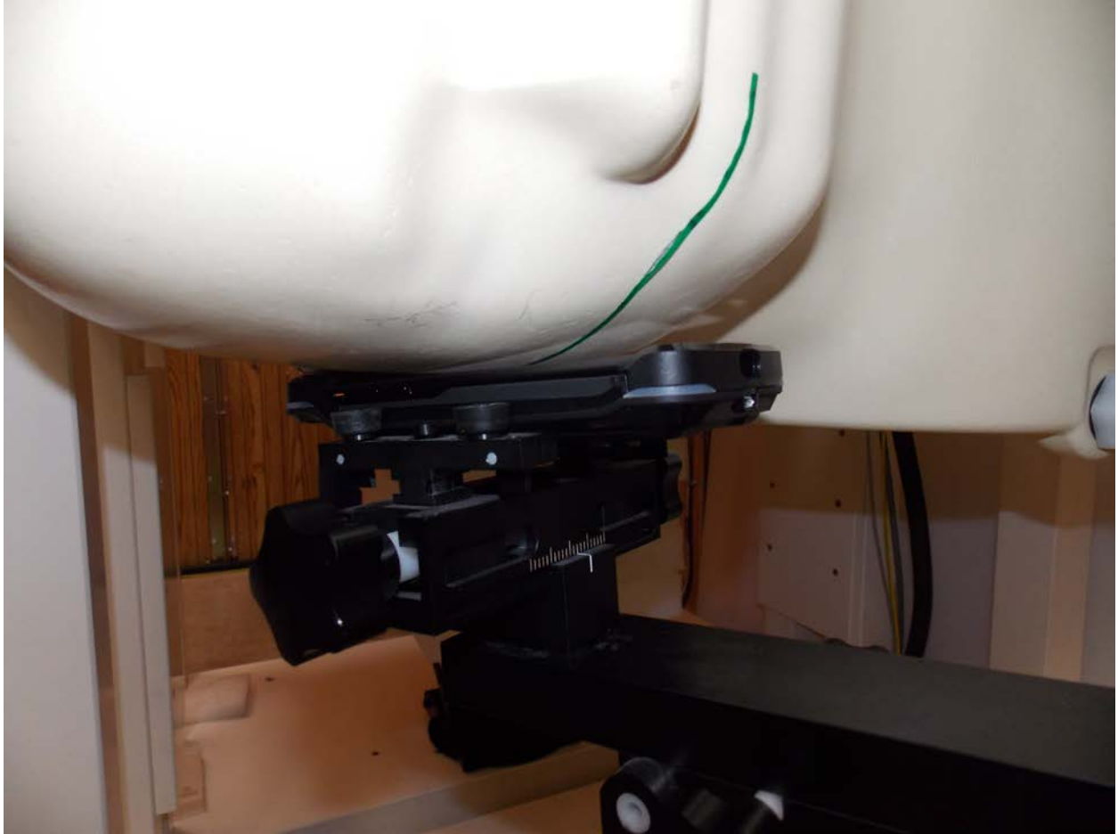
Right Touch With Case