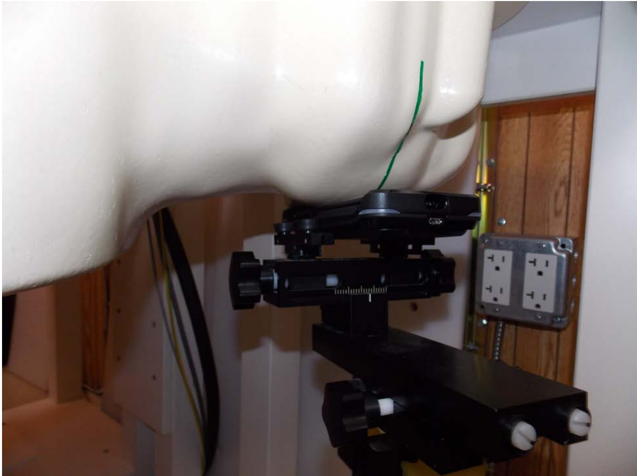
Left Touch With Case