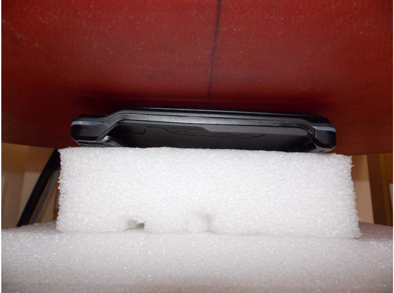
Body Back Configuration Case Only 0 mm Gap