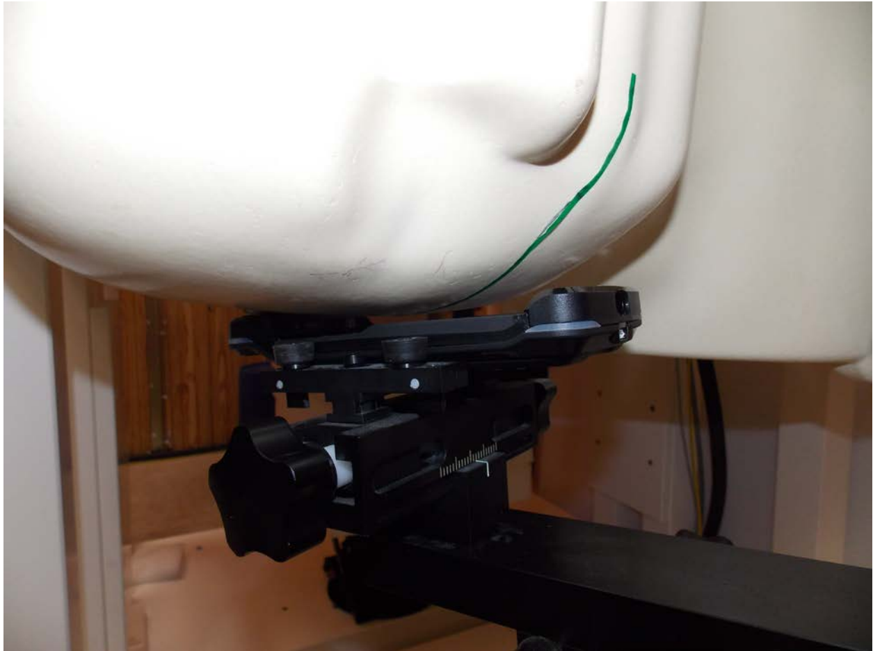
Right Touch Case Only