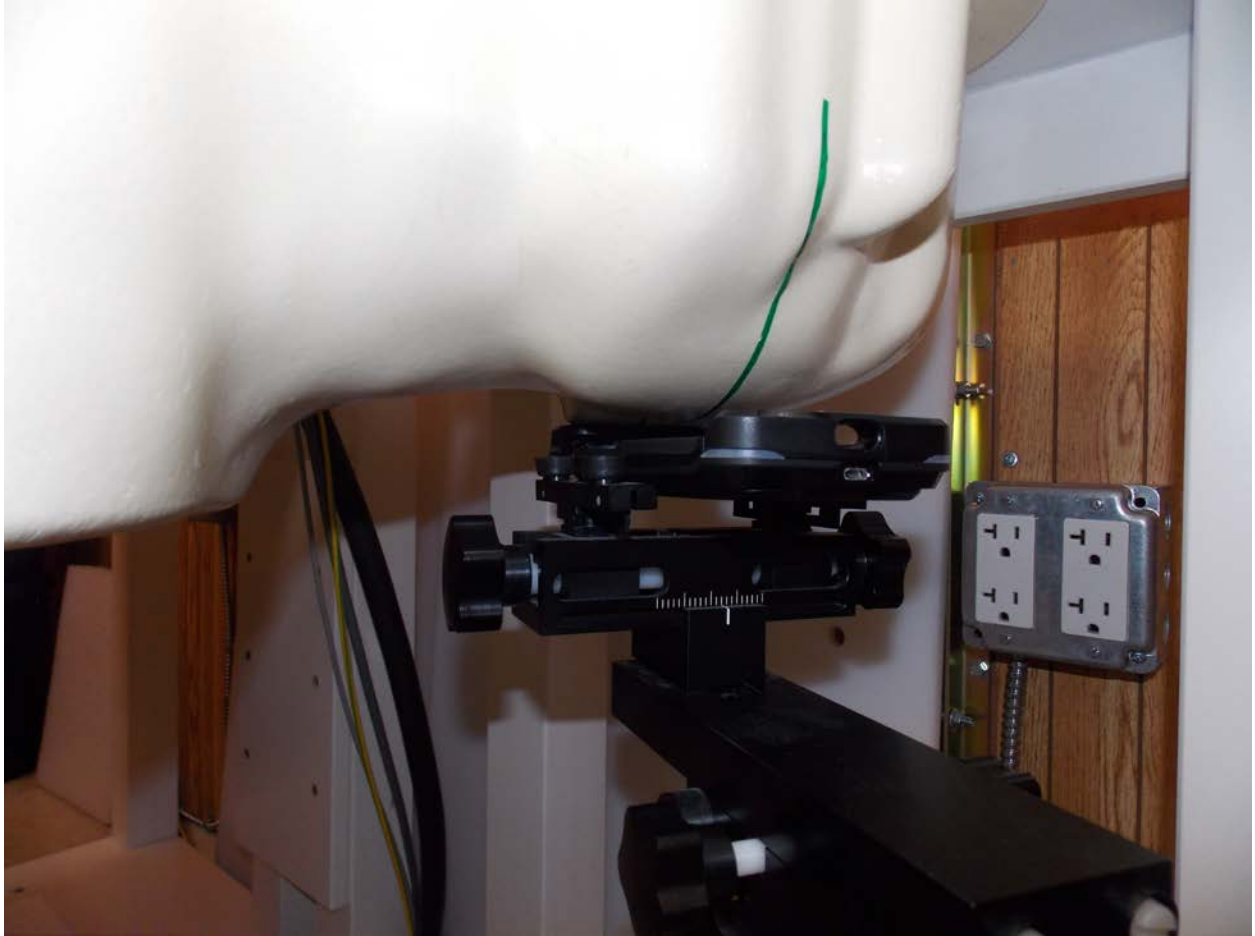
Left Touch Case Only