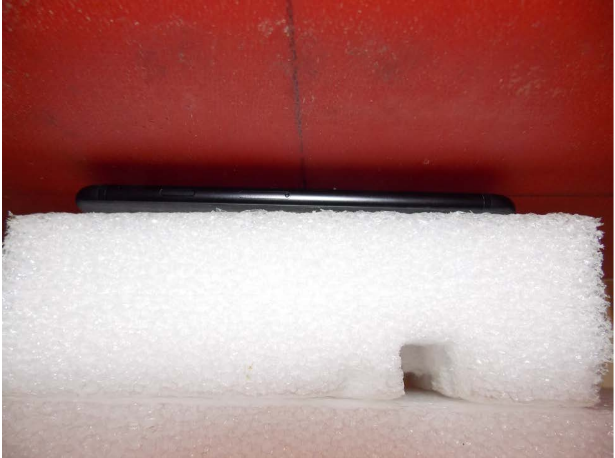
Body Back Configuration No Case 5 mm Gap