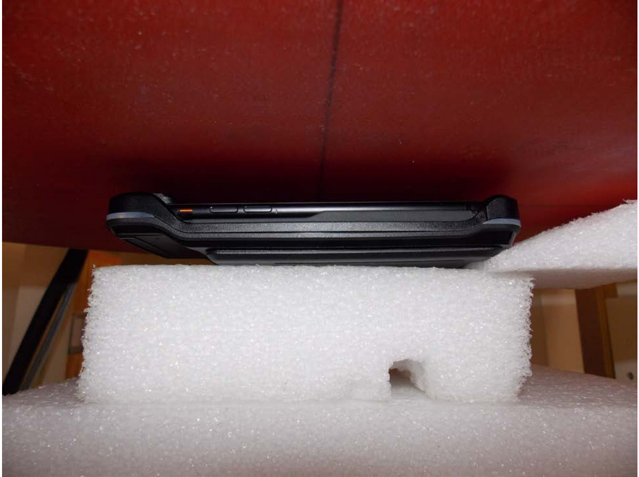
Body Front Configuration With Case 5 mm Gap