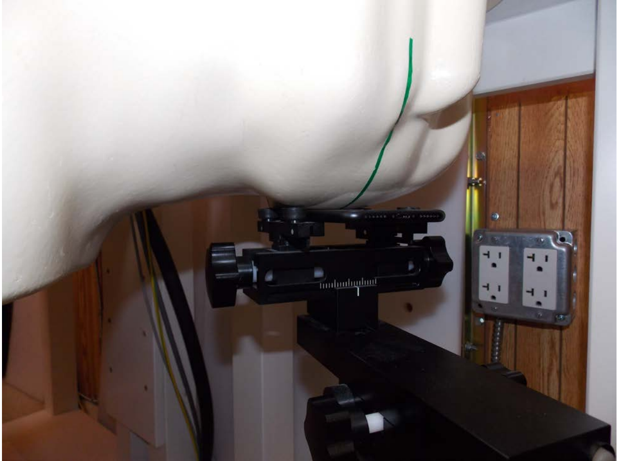
Left Touch No Case