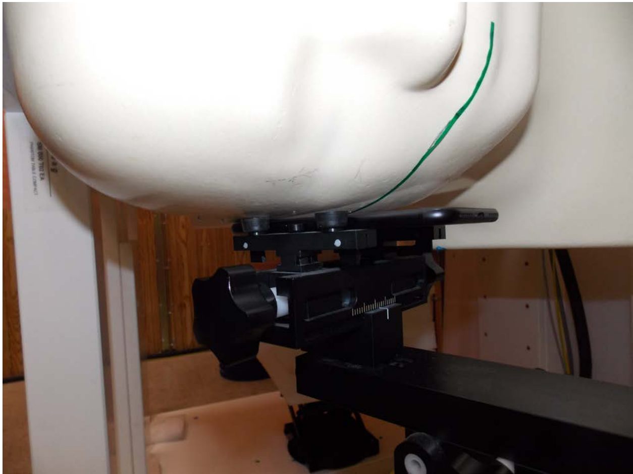
Right Touch No Case