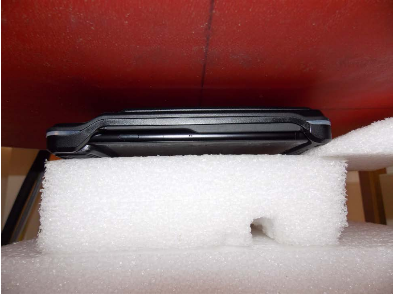
Body Back Configuration With Case 5 mm Gap