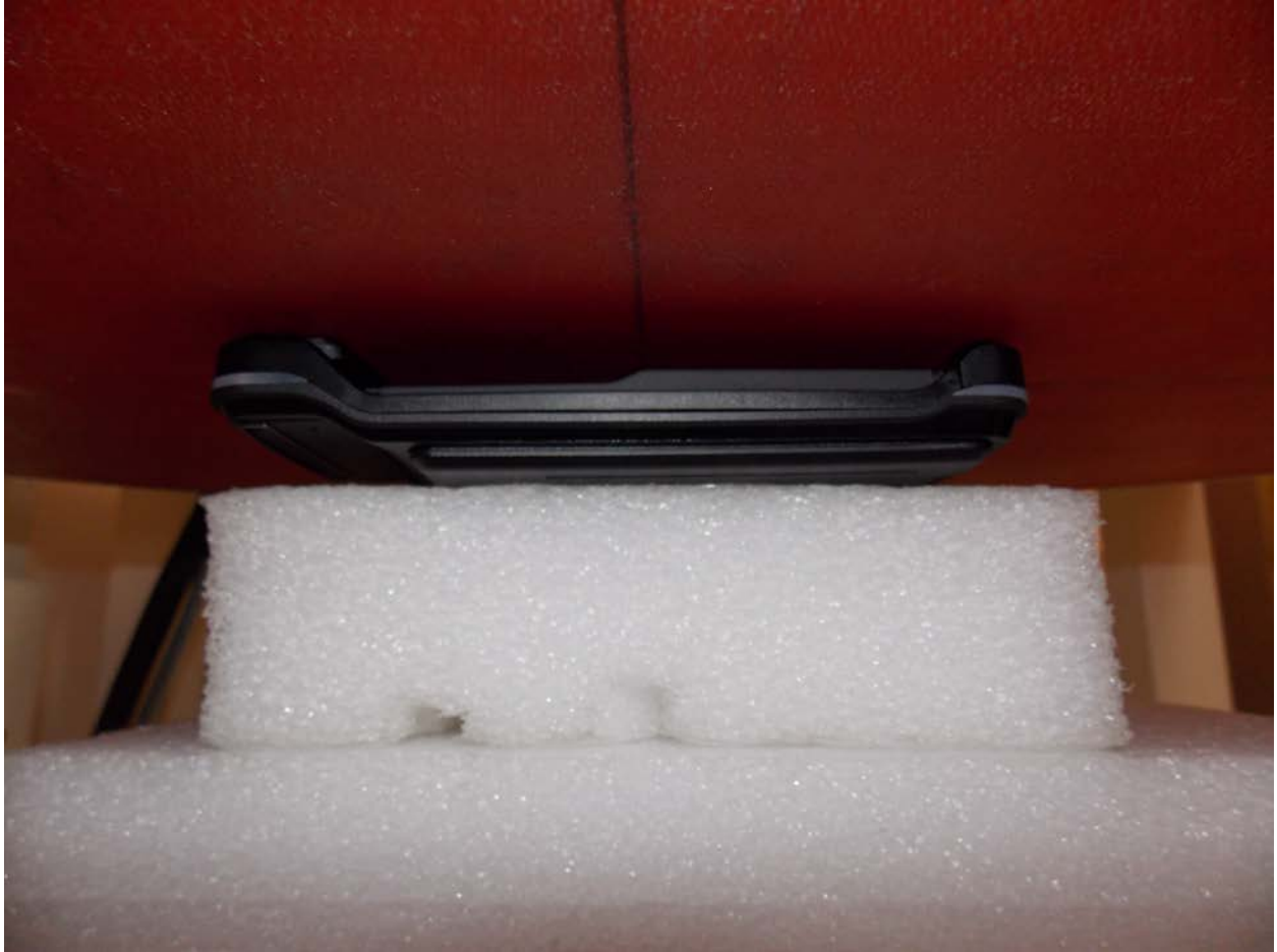
Body Front Configuration Case Only 0 mm Gap