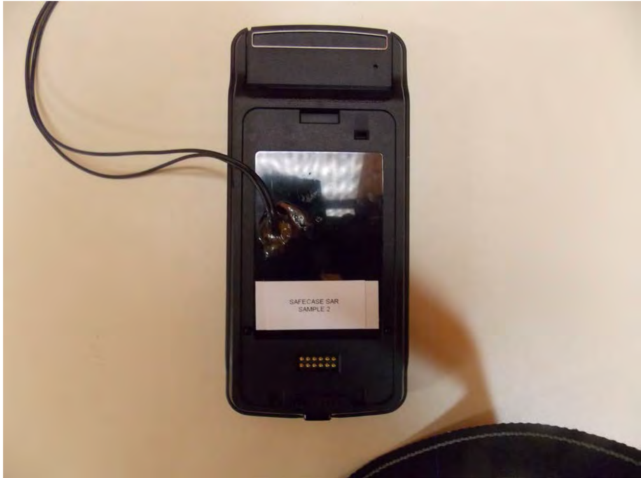
Back of Device (Case)