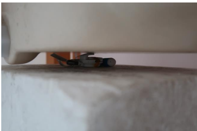
Back at 0 mm