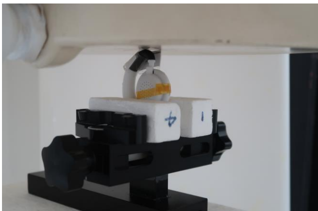
Top Side at 0 mm