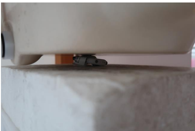
Front at 0 mm