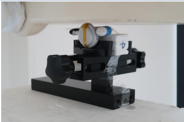
Right Side at 0 mm