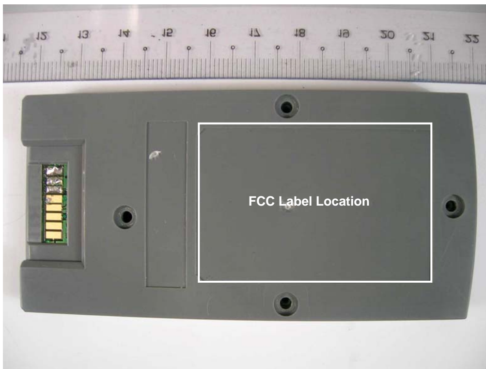
Physical Location of FCC ID on EUT