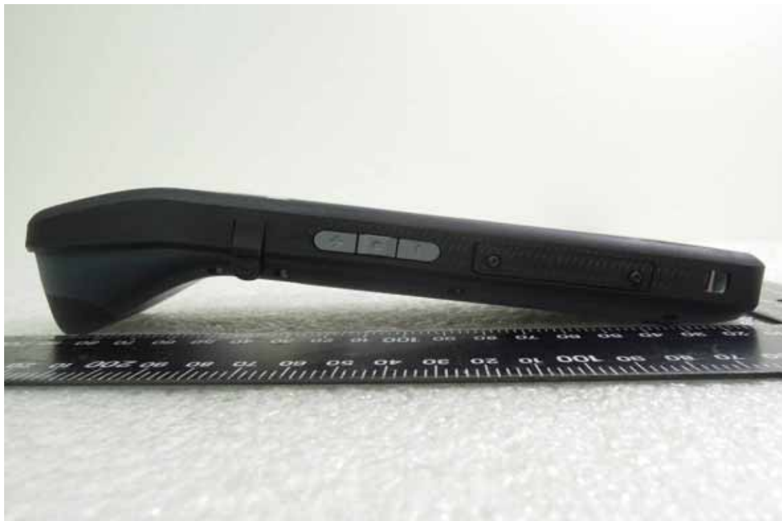
Side View of EUT – 5