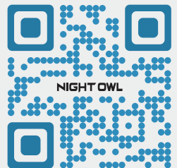
Option 2a Setup Video

Product images in setup videos may vary by model, but the setup is the same.