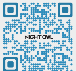
Option 2c Setup Video

NOTE: Our WNIP2 Series Wi-Fi NVR is ONLY compatible with our WNIP2 Series cameras.