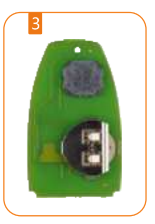
Take the battery out and replace new one