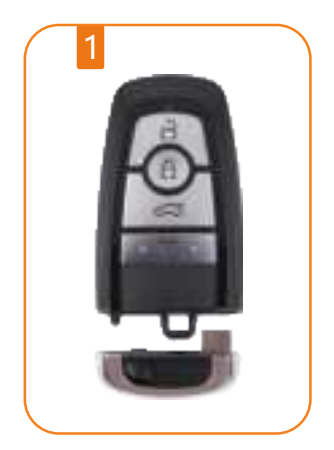
Press the back side button for loose the mechanical key holder

First use or when the battery runs out need to change new battery, following steps: