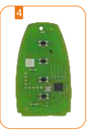
Install the key same as before