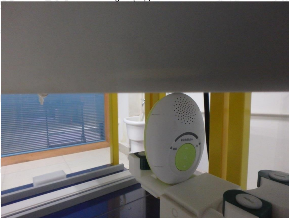
Edge 2 (Right) 0mm