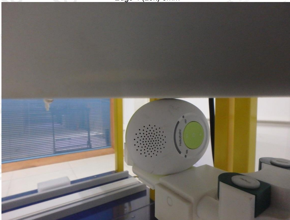
Edge 4 (Left) 0mm

The results shown in this test report refer only to the sample(s) tested unless otherwise stated and the sample(s) are retained for 30 days only. The document is issued by AGC, this document cannot be reproduced except in full with our prior written permission. The more details and the authenticity of the report will be confirmed at http://www.agc-cert.com .