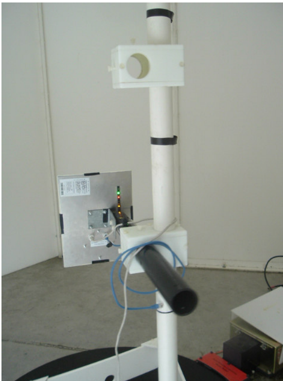
Radiated emissions test setup