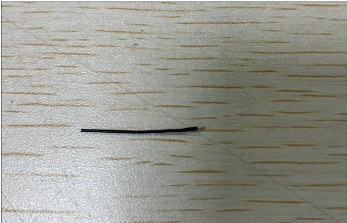
Antenna Top View