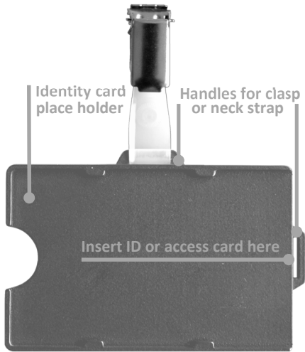
Front side of the ZONITH Bluetooth LE ID Badge™

Charging of the ZONITH Bluetooth LE ID Badge™ is done via the Micro B USB connector. Use a standard USB connection or charger supporting: 5V - 150mA.