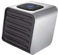
U172 User Manual