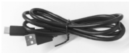
Type-C USB Cable