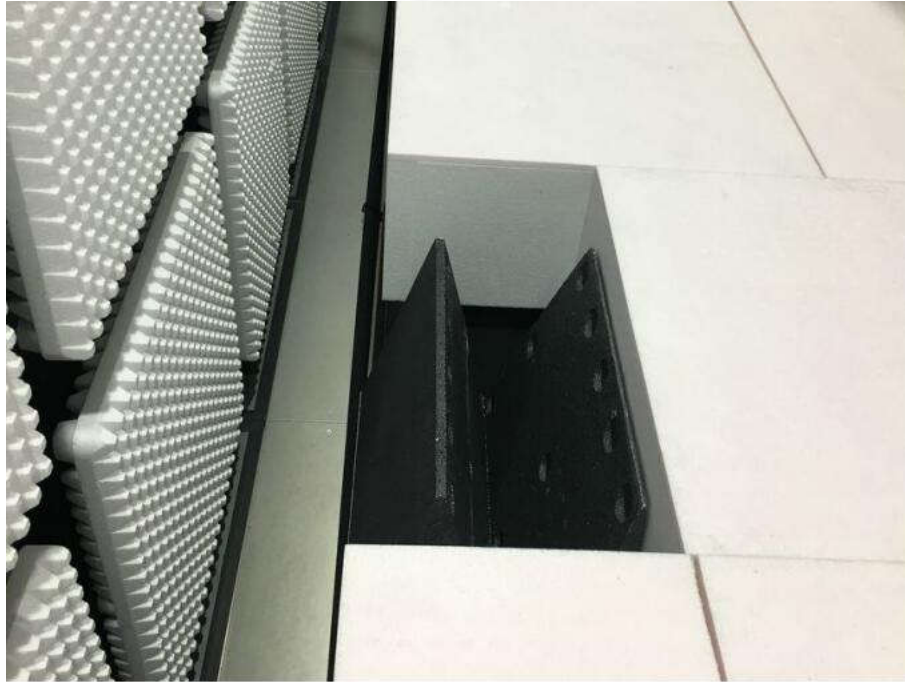
Radiated spurious emission Test Setup-3(Above 1GHz) There are absorbing materials under the ground.