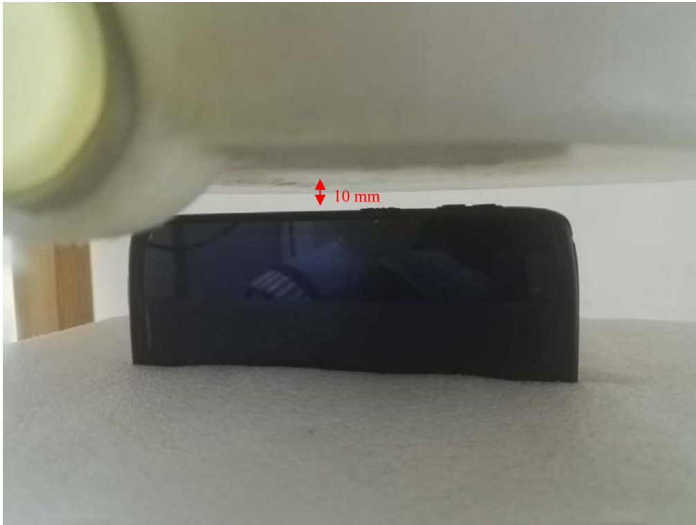
Body-worn Left Setup Photo (10mm)