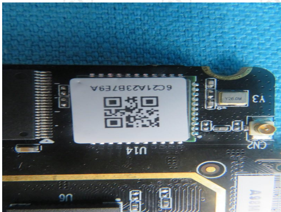
View of Product-7