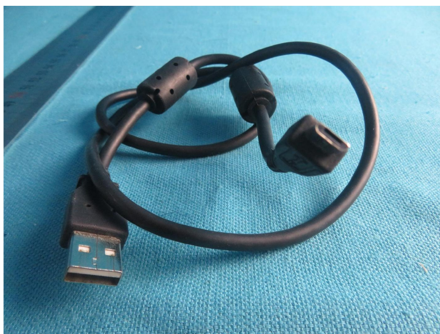
View of Product-8