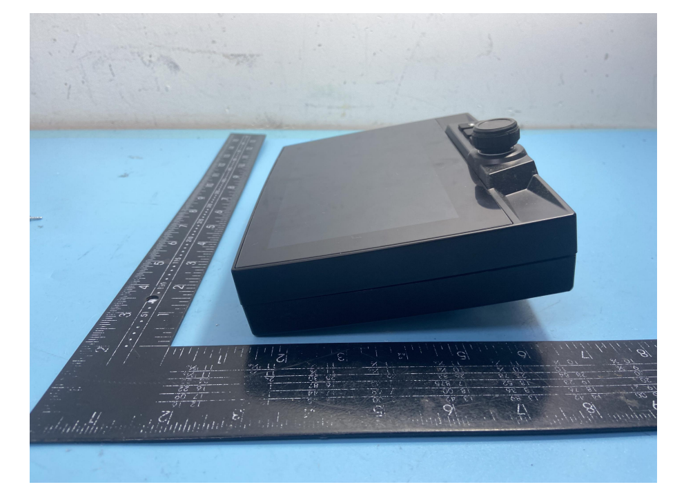
TOP VIEW OF SAMPLE