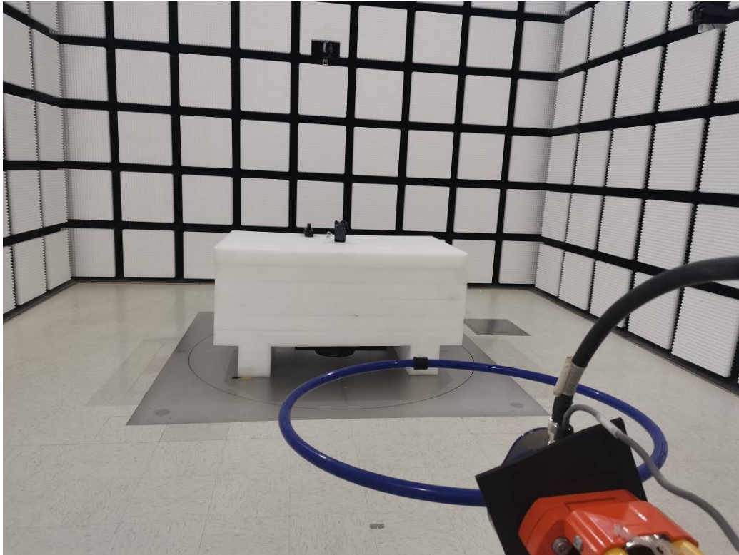
Radiated Emissions 30M-1G View