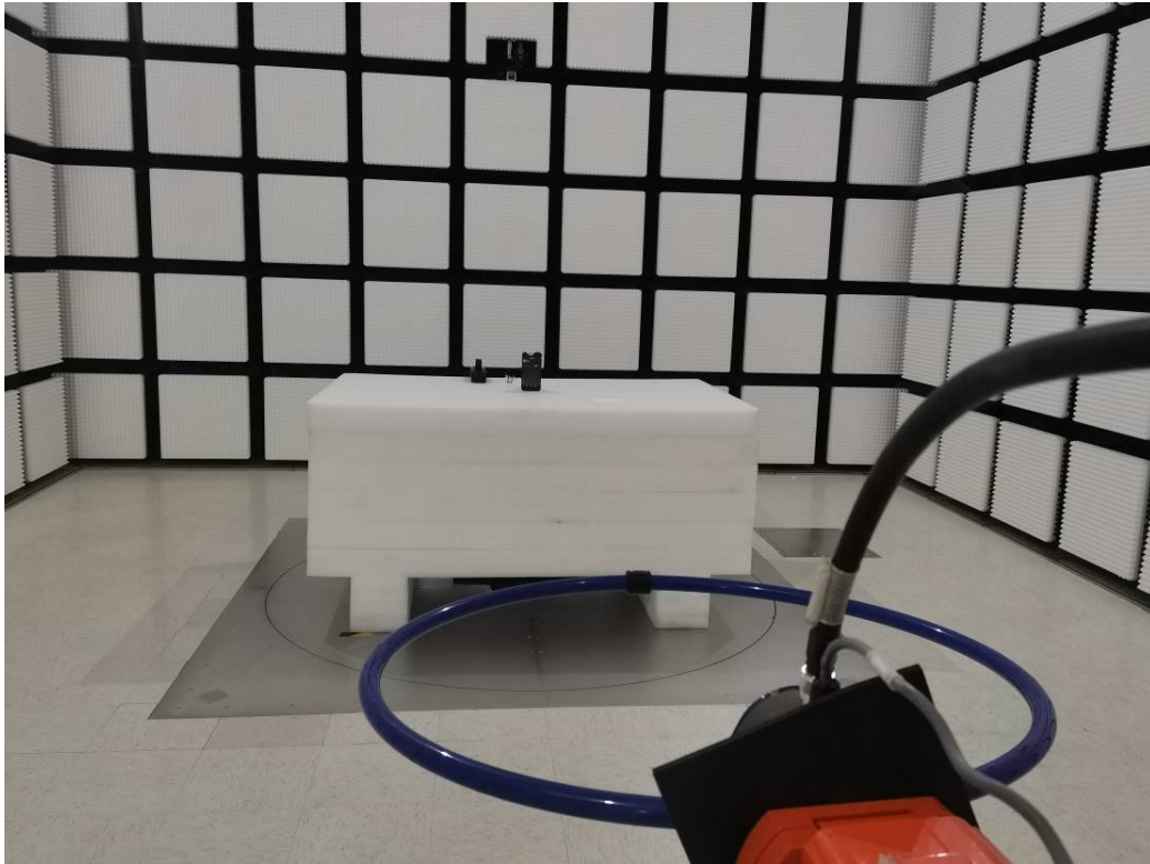
Radiated Emissions 30M-1GHz View