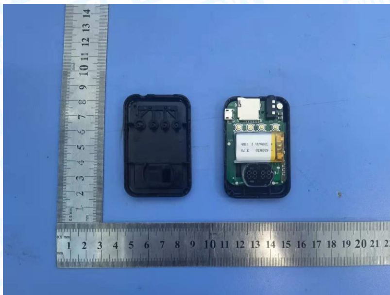
Photo 9 Appearance of PCB