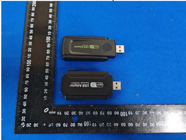
Model Number: USB WIFI adapter card