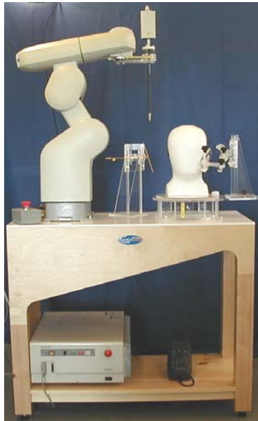
Figure 6: Principal components of the SAR measurement test bench

After an area scan has been done at a fixed distance of 8mm from the surface of the phantom on the source side, a 3D scan is set up around the location of the maximum spot SAR. First, a point within the scan area is visited by the probe and a SAR reading taken at the start of testing. At the end of testing, the probe is returned to the same point and a second reading is taken. Comparison between these start and end readings enables the power drift during measurement to be assessed.