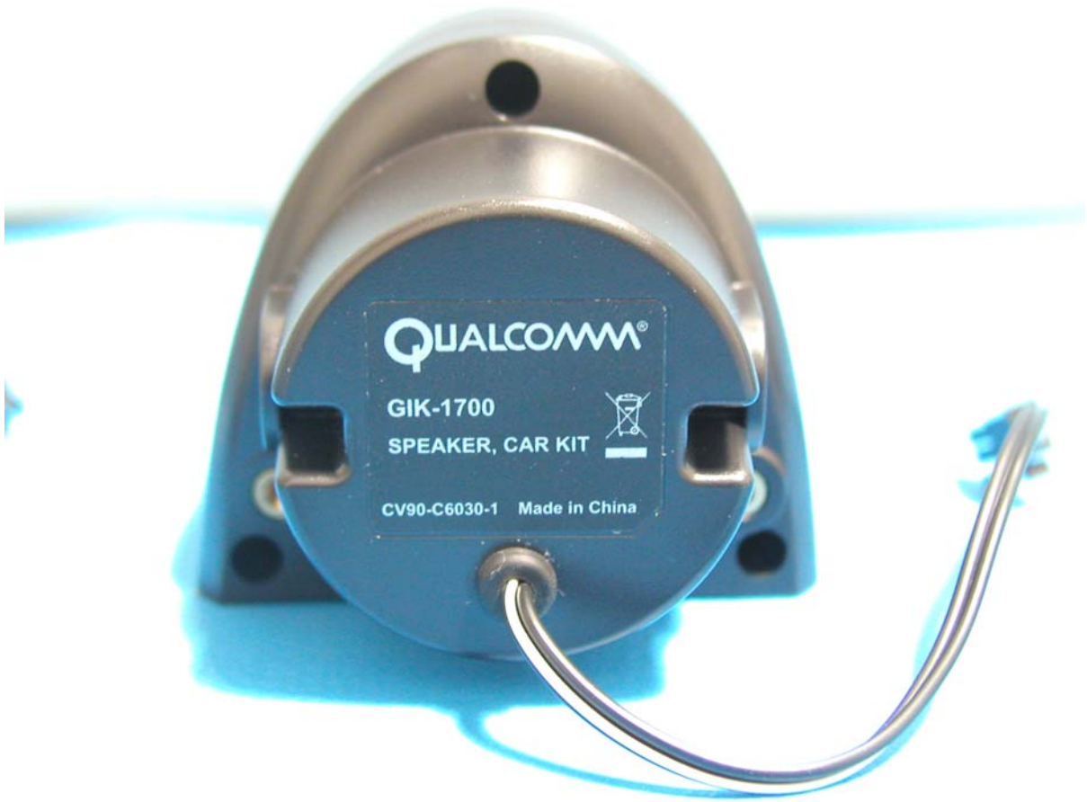
Figure 12 Speaker-Rear View