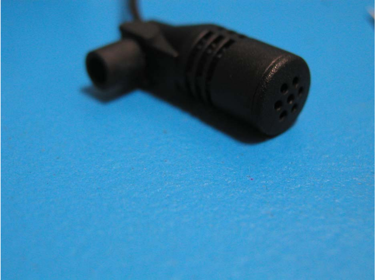
Figure 6 HFK External- Microphone Detail