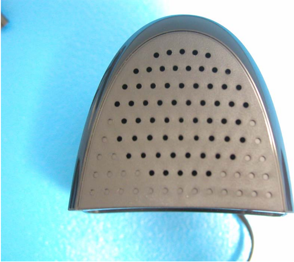
Figure 13 Speaker Front