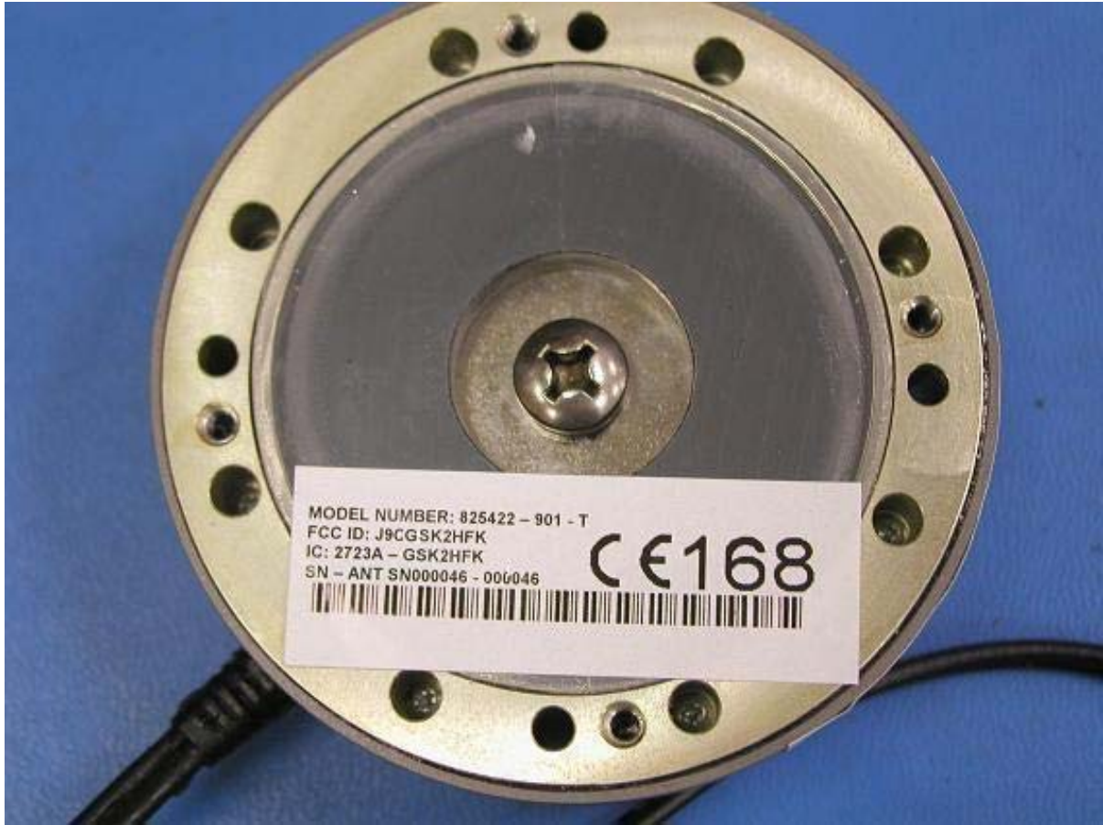
Figure 10 Antenna Label 2