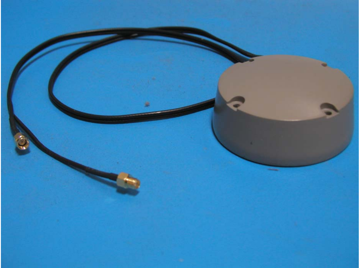
Figure 8 HFK External- ODU Antenna