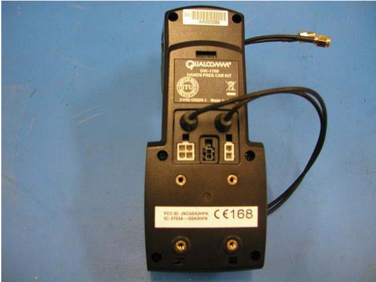
Figure 3 HFK External- Back