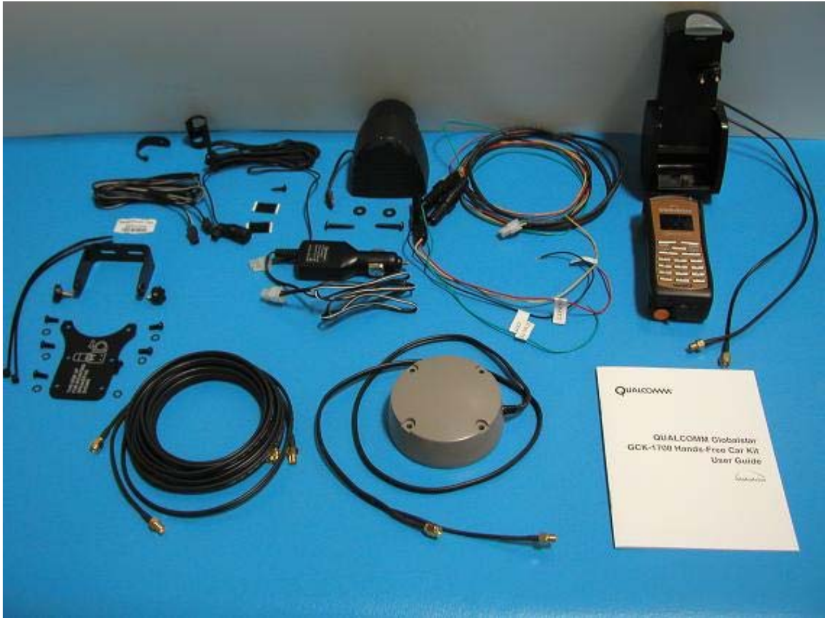
Figure 5 HFK External- Entire Kit