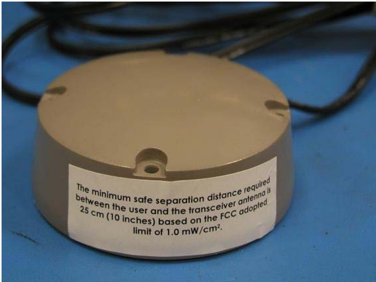
Figure 9 Antenna Label 1