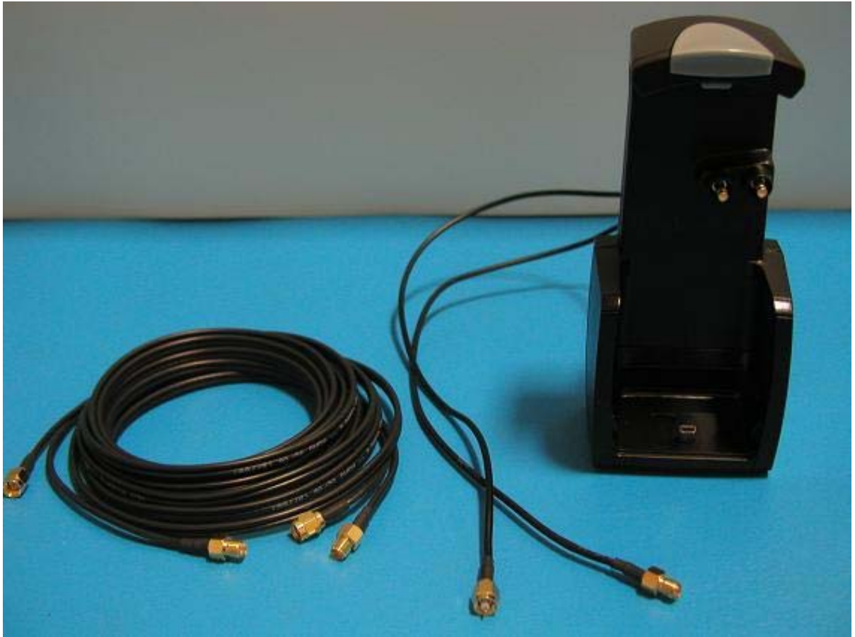
Figure 2 HFK External- Cables