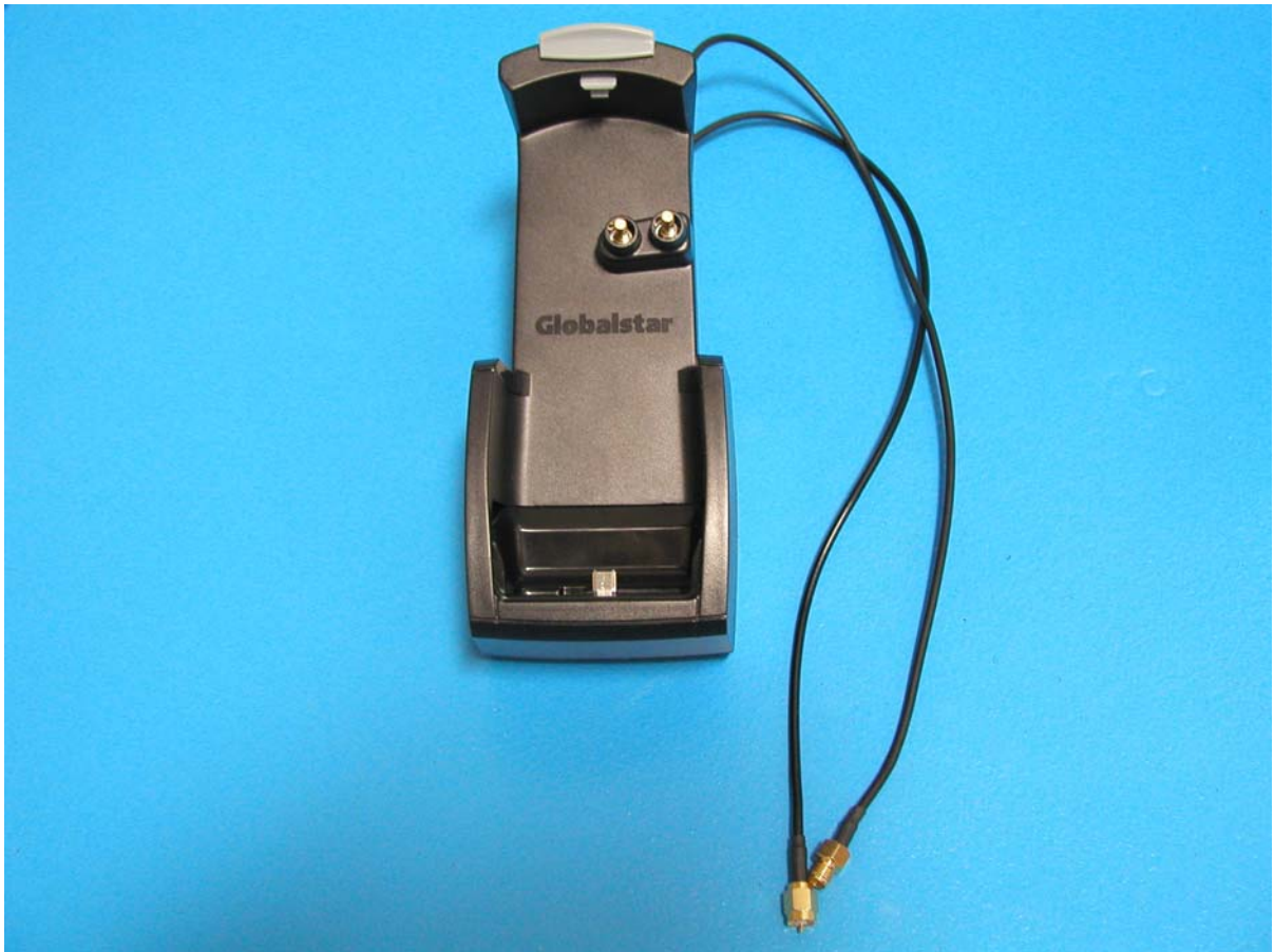
Figure 1 HFK External -Front