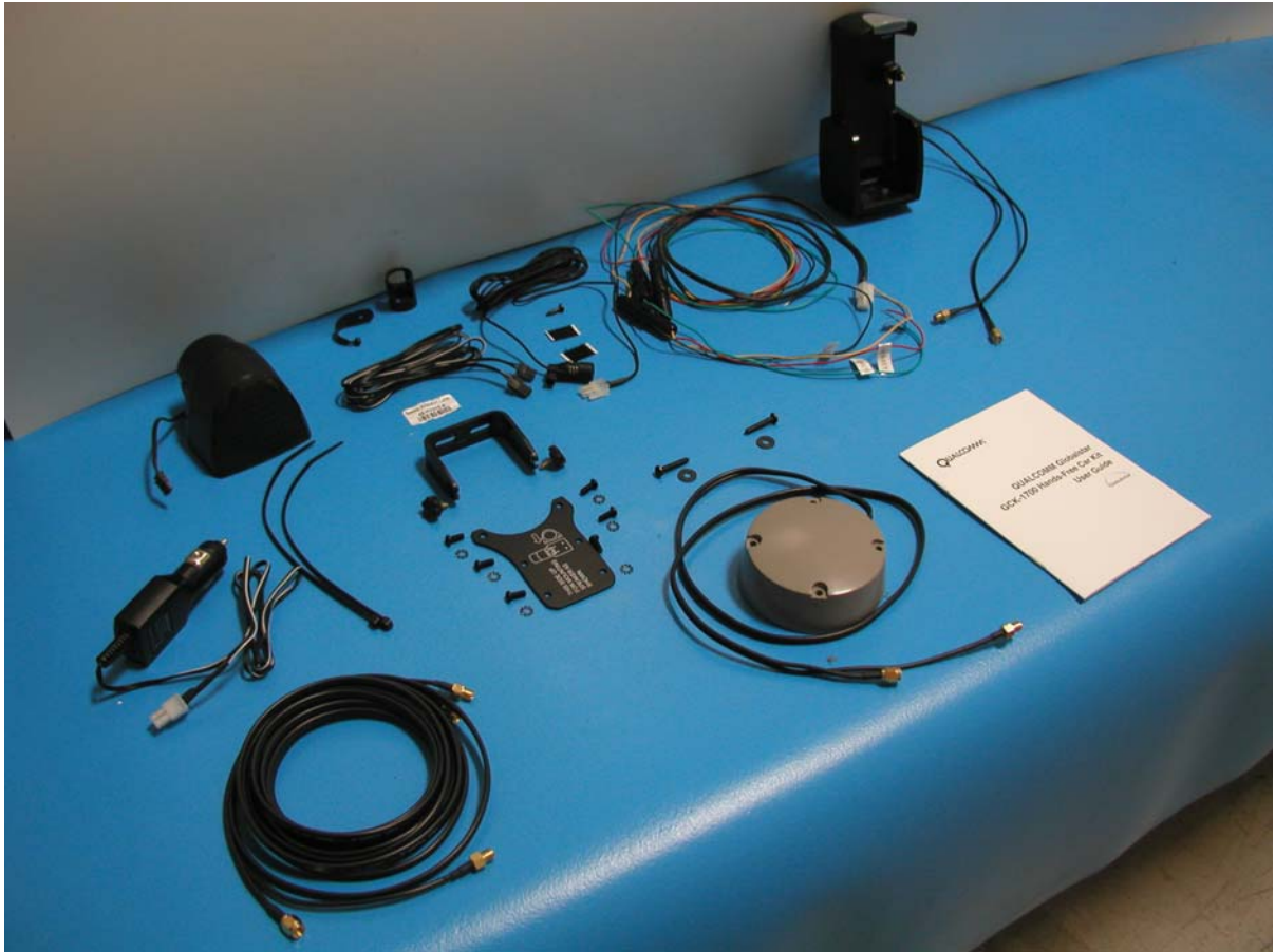
Figure 4 HFK External-Entire Kit