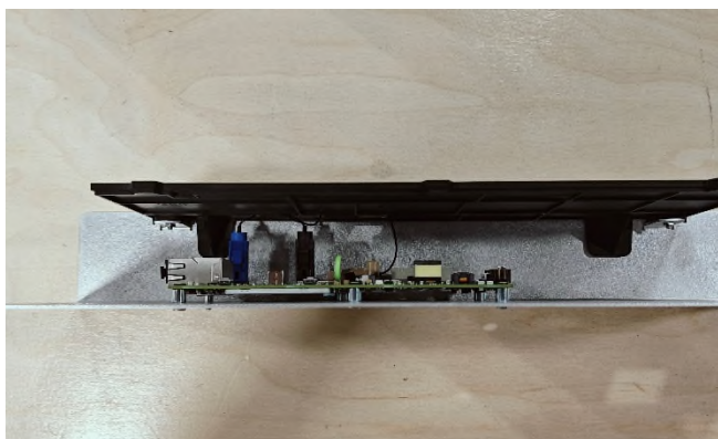
Figure 4– DUT front view