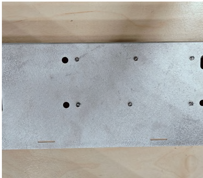
Figure 3 – DUT bottom view