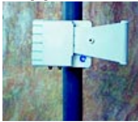
BTR 28-07M Transceiver

The BTR 28-07 GHz MMIC (NTVG14CA) outdoor transceiver is a state-of-the-art broadband microwave transceiver designed to operate at various frequency bands downstream. It is a combined broadband transmitter and receiver deployed in Nortel Networks Reunion point-to-multipoint system. It is compatible with Reunion's Release 1.2 and 1.3 equipment.