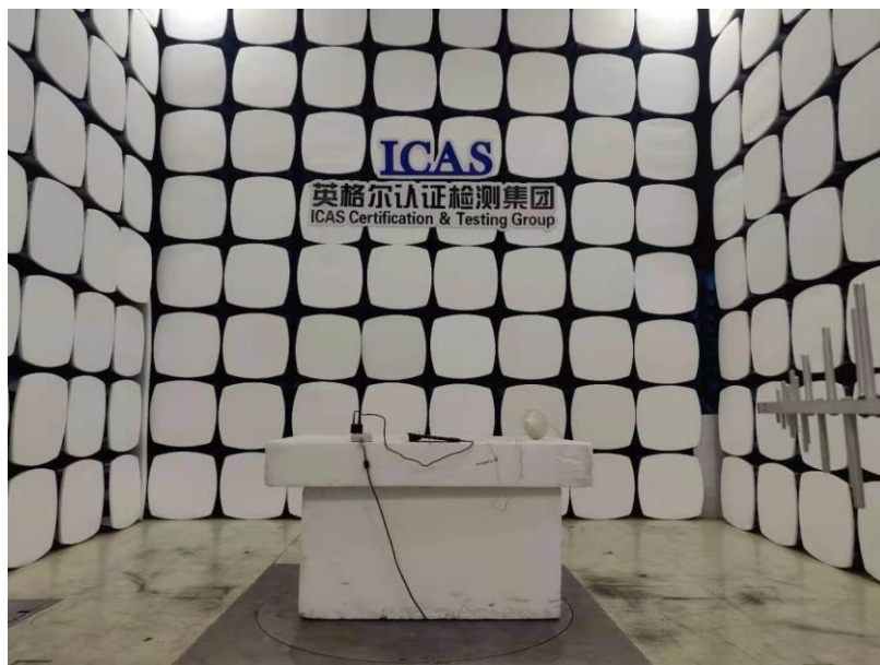
Below 1 GHz