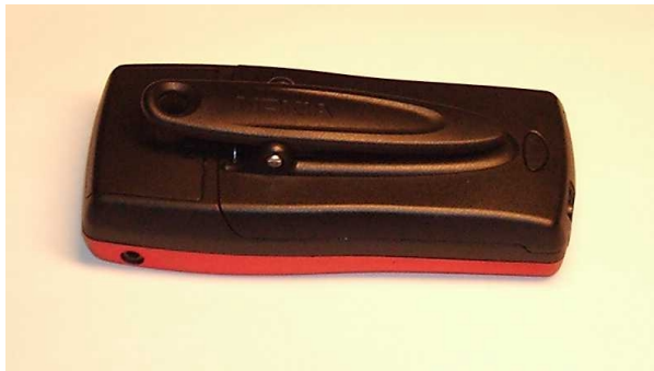
Figure 1. Belt Clip SKB-3

Our approach was to measure the SAR, when a phone is used with body worn accessories or is against the Flat Phantom. Body worn accessory SKB-3 Belt Clip (figure 1) was tested. The measurement test equipment and setup was the same as used and referred in SAR TEST REPORT of NOKIA 8260.