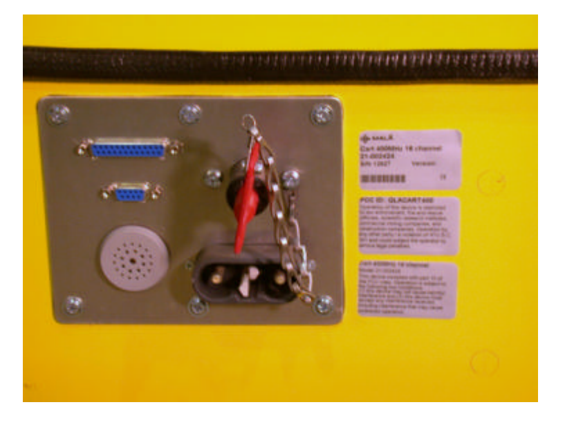
Figure 2. Placement of the FCC labels at the front of the UWB-unit. Visible at all times.