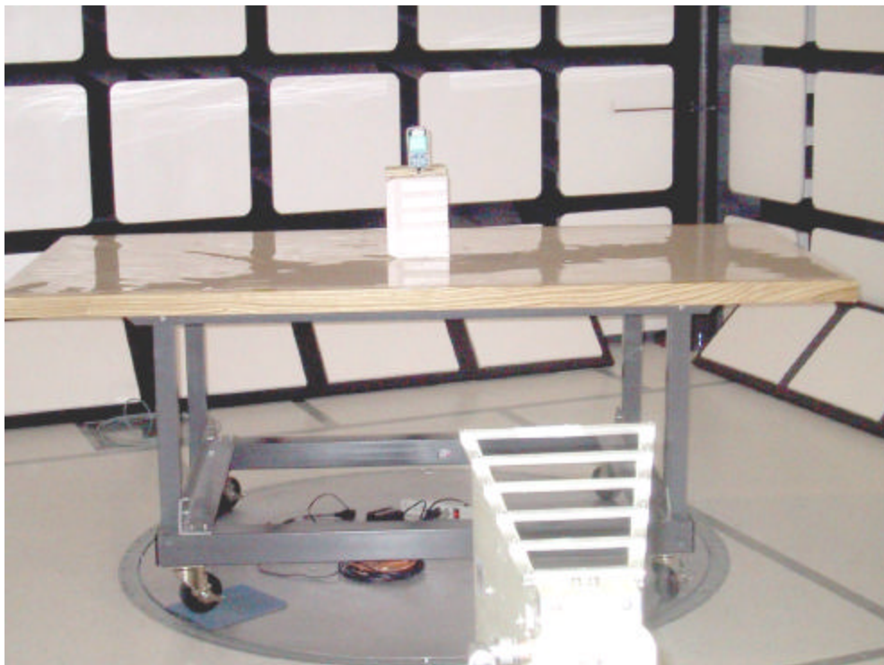
Radiated Emissions at 3.0 metres