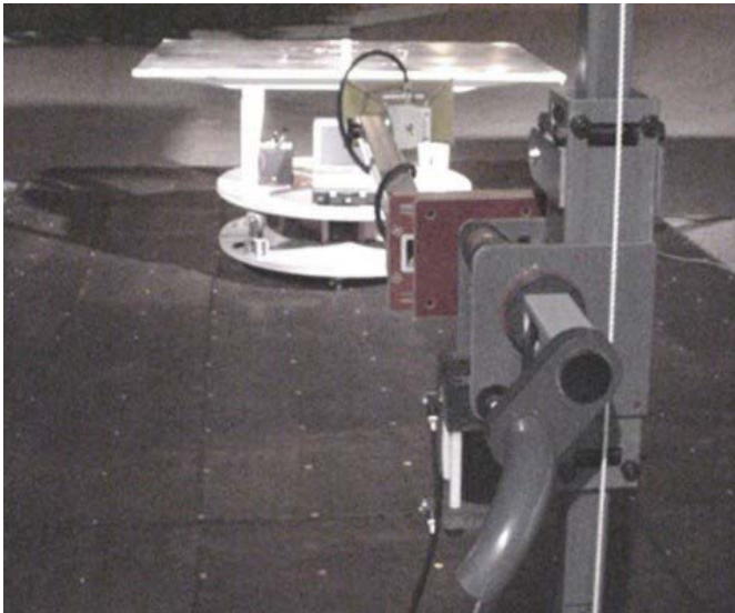
Radiated Measurement Test Setup