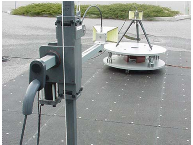
Signal Substitution Test Setup