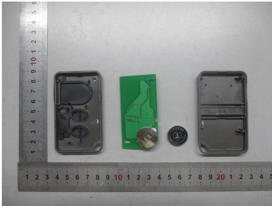
EUT – Battery View