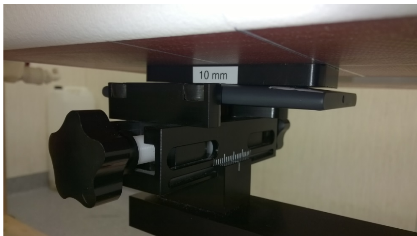
Photo of the device positioned for WR mode measurement –back facing phantom. The spacer was removed before the start of the measurements.

The device was placed in the SPEAG holder using the Microsoft spacer and, in sequence, the back, display and each of the 4 edges was positioned 10.0mm away from the flat phantom. The spacer was removed before the start of the measurements.