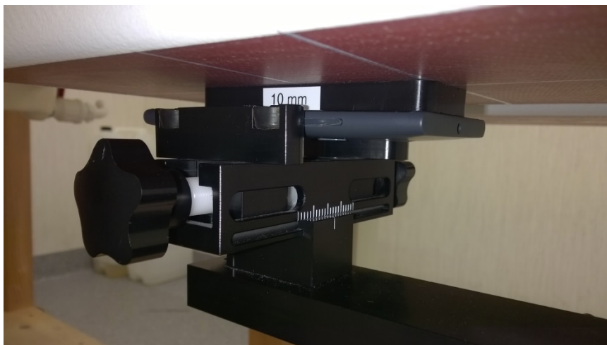
Photo of the device positioned for WR mode measurement – display facing phantom. The spacer was removed before the start of the measurements.