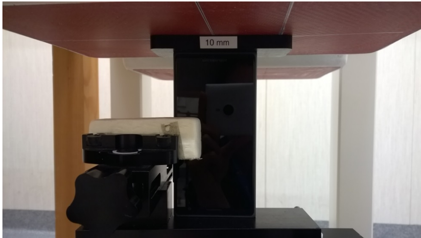
Photo of the device positioned for WR mode measurement – bottom edge facing phantom. The spacer was removed before the start of the measurements.