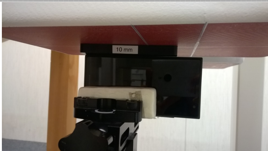
Photo of the device positioned for WR mode measurement – left edge facing phantom. The spacer was removed before the start of the measurements.