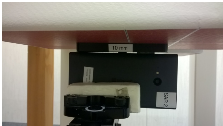
Photo of the device positioned for WR mode measurement – right edge facing phantom. The spacer was removed before the start of the measurements