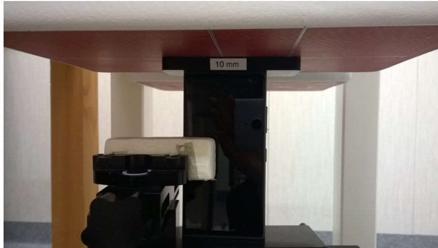
Photo of the device positioned for WR mode measurement – top edge facing phantom. The spacer was removed before the start of the measurements.