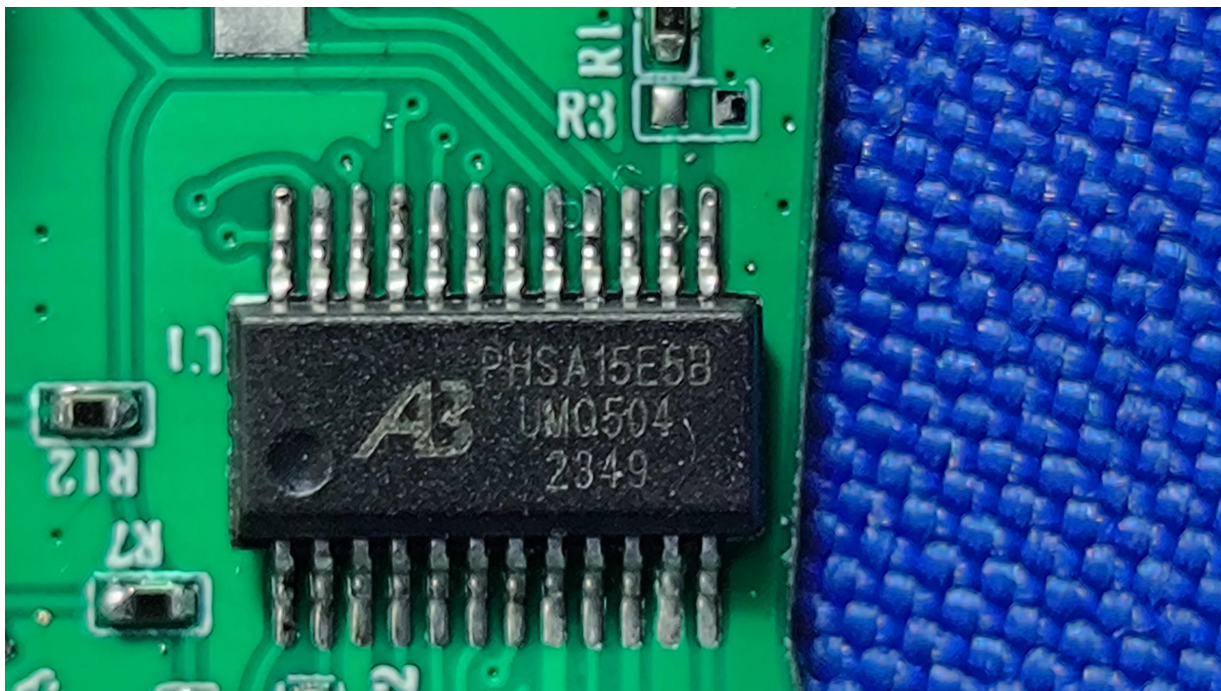
View of Product-13