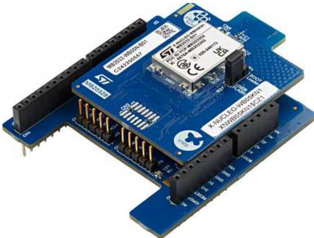
Figure 1. X-NUCLEO-WB05KN1 global view

X-NUCLEO-WB05KN1 interfaces with the STM32 Nucleo microcontroller via UART (default) with and without hardware flow control. Full duplex SPI with an interrupt line is also available. The firmware loaded on the module defines the host interface and, to modify it, simply change the firmware without modifying the hardware.