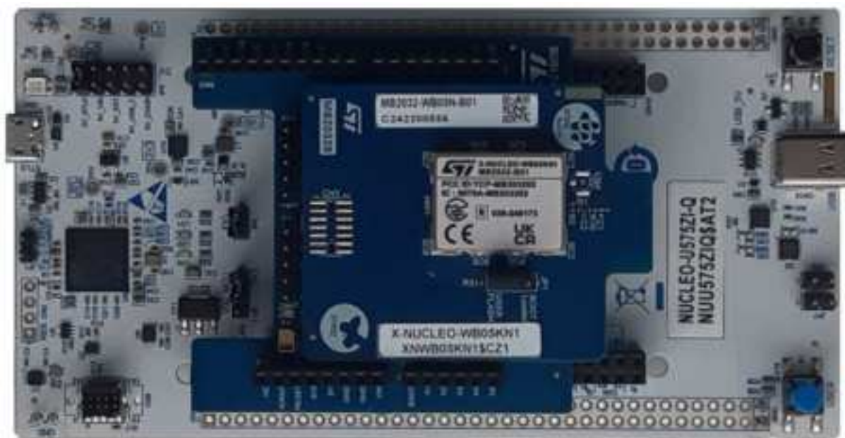
Figure 2. X-NUCLEO-WB05KN1 plugged into NUCLEO-U575ZI-Q

To complete the system setup, the user needs: